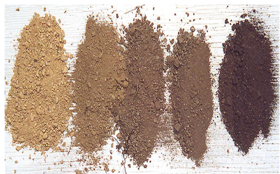
Fig. 2. Different soil samples collected from different part of campus for physical analysis.

The soil samples of four different areas i.e. oasis of roses, bus stand, fine arts area and chem. Dept. having soil types flour like, powder like, sandy type and powder like respectively in comparison with each other. Oasis of roses, bus stand and chem. Dept. soil form very good ribbon shaped band in comparison to fine arts area soil which do not form a ribbon shaped band. Fine arts area soil was good porous in comparison to other three areas like bus stand, oasis of roses and chem. Dept soil, which soil was less porous. The soil samples of four different areas i.e. oasis of roses, bus stand, fine arts area, and chem. Dept having different soil colors grey, pale brown, light brown, grey and brown respectively in comparison with each other.