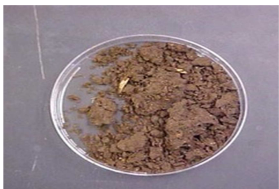
Table 3. Showing soil moisture content.