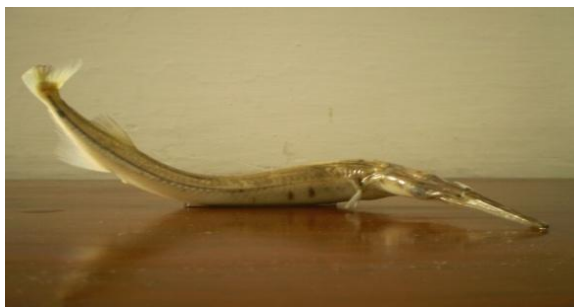
Fig. 4. Xenentodon cancila .