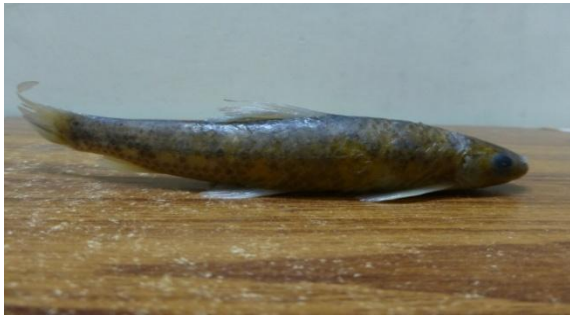
Fig. 13. Labeo rohita .