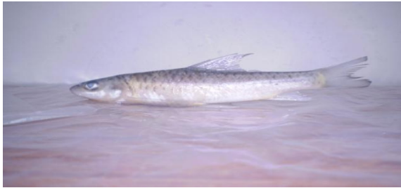
Fig. 12. Labeo calbasu .