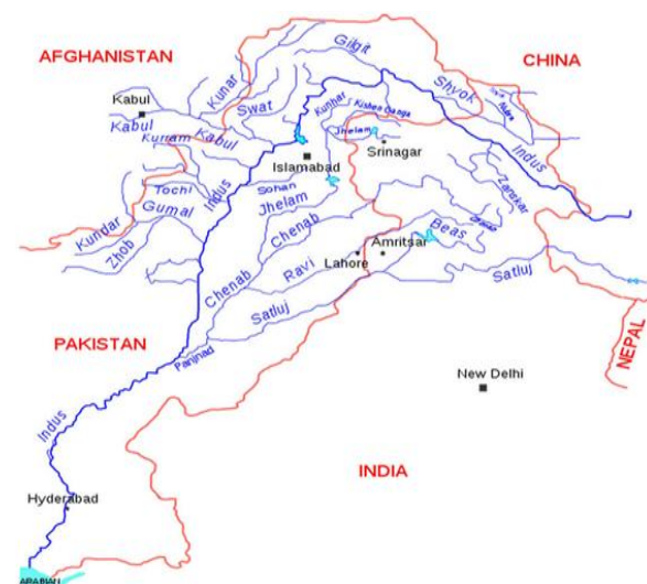
Fig. 1. Showing flow of Indus River through Pakistan.

The fish were collected from part of Indus River at Beka Swabi. The fish were collected by using small meshed cast nets, by hooks, by fishing rods, and also we take the help of scoop net. Nets were set up at random throughout the study areas.