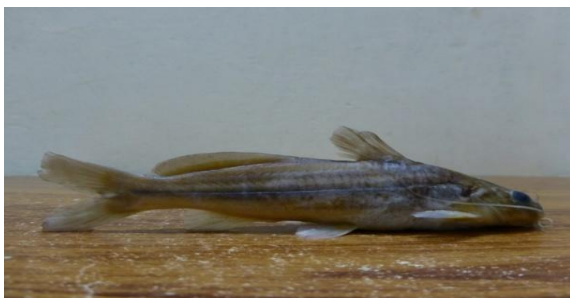
Fig. 14. Mystus bleekeri .