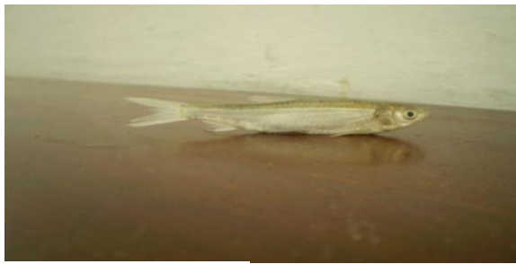
Fig. 3. Rasbora danicon .