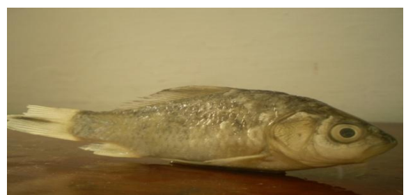
Fig. 11. Carassius auratus .