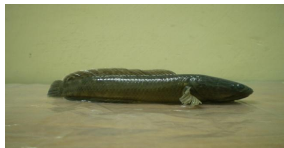
Fig. 9. Channa gachua .