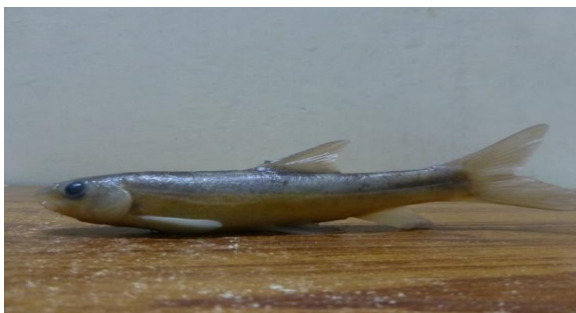
Fig. 16. Tor putitora .