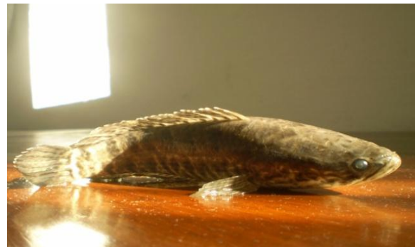
Fig. 8. Channa punctatus .