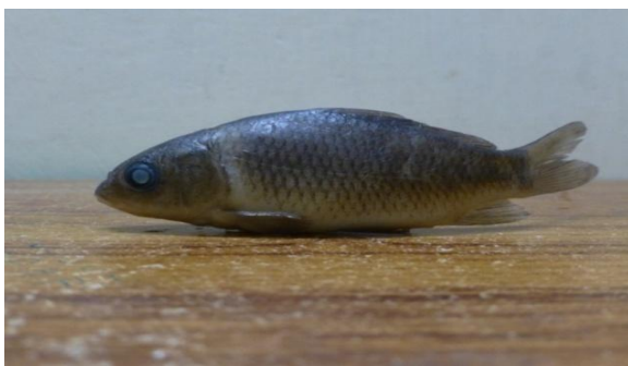
Fig. 15. Catla catla .