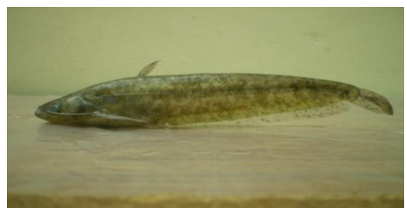
Fig. 10. Ompok pabda .