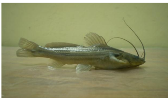
Fig. 6. Mystus vittatus .