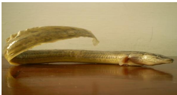
Fig. 5. Mastacembelus armatus .