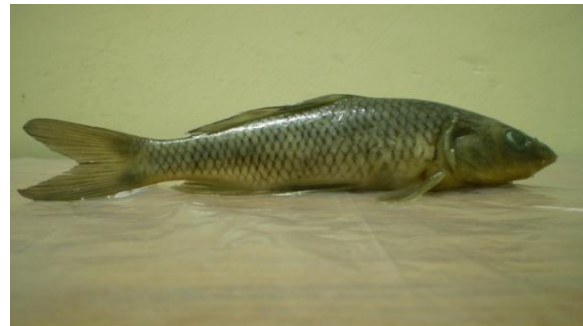
Fig. 7. Cyprinus carpio .