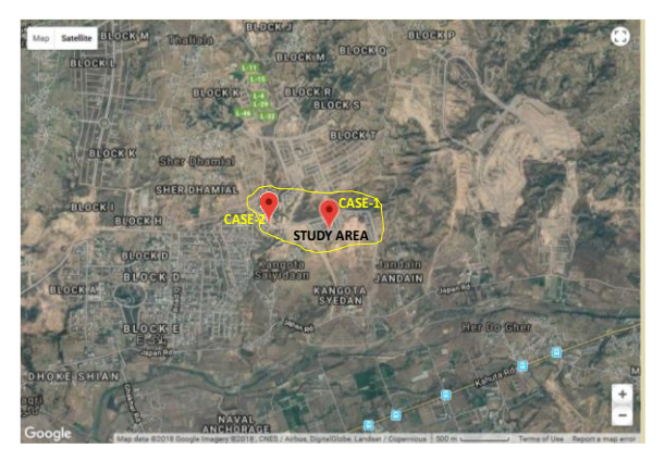
Fig. 1. Study Area (after google earth and SamSam model).

The study area is located in Zone-V of Islamabad. This site has accessibility to Islamabad Highway through Japan Road. The site is surrounded by different housing societies on all its sides. In the study area (refer Fig. 1), there are two types of construction i.e. 500 row houses (termed as case-1 in this study, each house of 25'x50' plot size) and 126 apartment blocks (termed as case-2 in this study, each block has 8 apartments) which may be labeled as horizontal and vertical density of the population, respectively. In the study area, these row houses and apartments constitute independent wings i.e. both are separated by a storm drain (called nullah in local language).