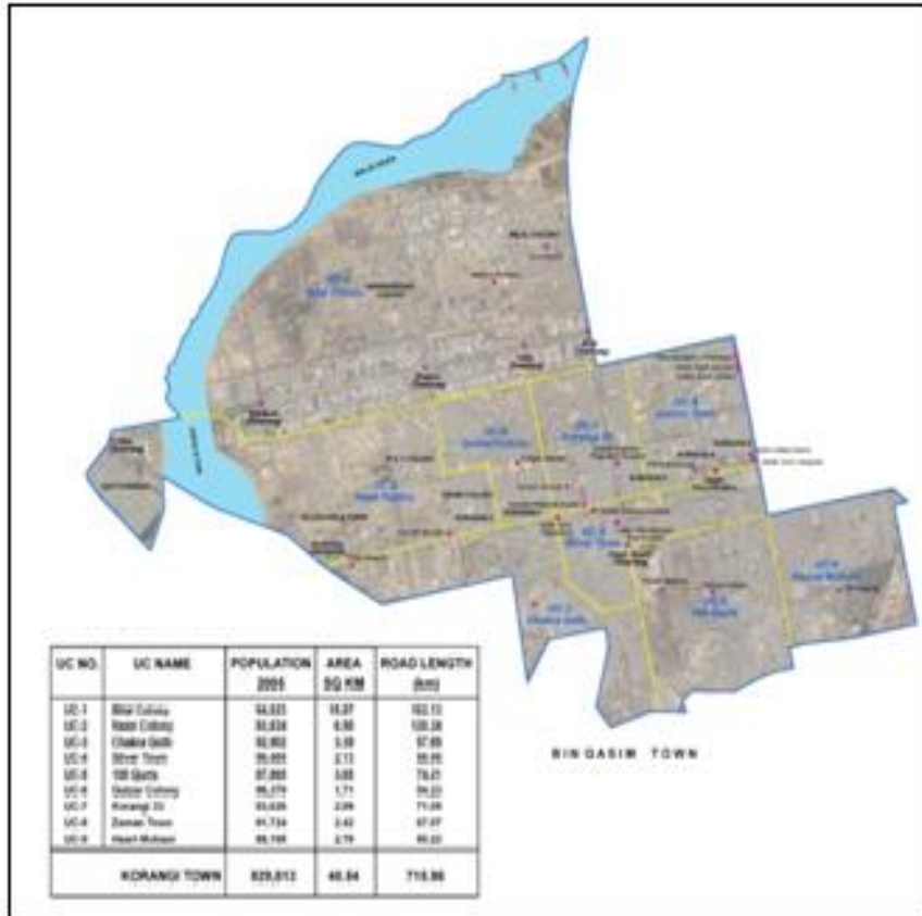
Fig. 2. Map of Korangi Industrial Area Karachi including sampling locations.