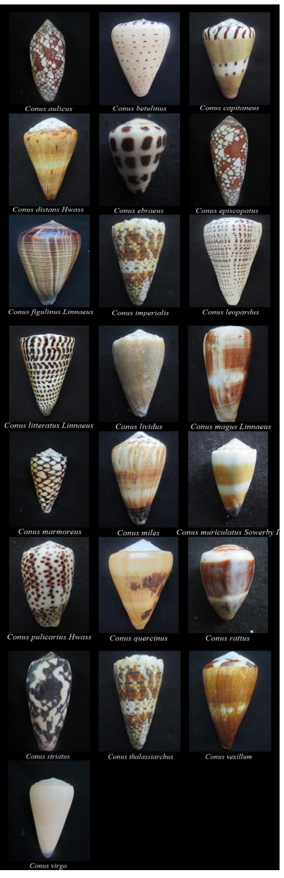
Fig. 2. Conus species identified in selected shoreline of Sulu, Philippines