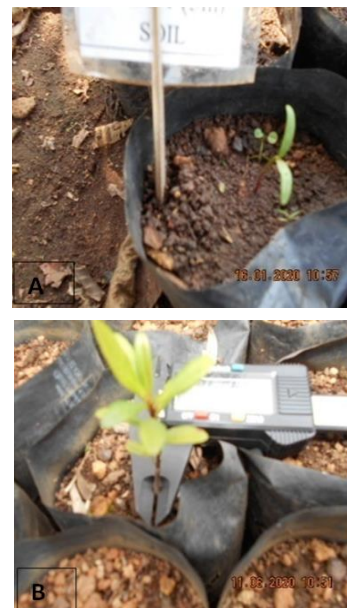
Fig. 2. Germination characteristics of Ternstroemia cameroonensis (A: seedling emergence after 50 days, B: seedling emergence after 10 months).