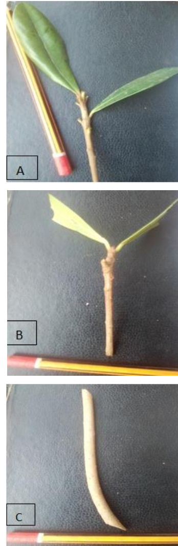
Fig. 1. Prepared cuttings of Ternstroemia cameroonensis (A: cutting with 50% leave area, B: cutting with 100% leave area, C: cutting with 0% leave area.

For each cutting, all the leaves except two attached to the apical node were removed. The apical leaves were trimmed to the desired surface area (0, 50% and 100%) of their laminar area (Fig. 1). The prepared cuttings were treated with systemic insecticide and fungicide K-Optimal and Plantomil super prior to dipping in various rooting media.