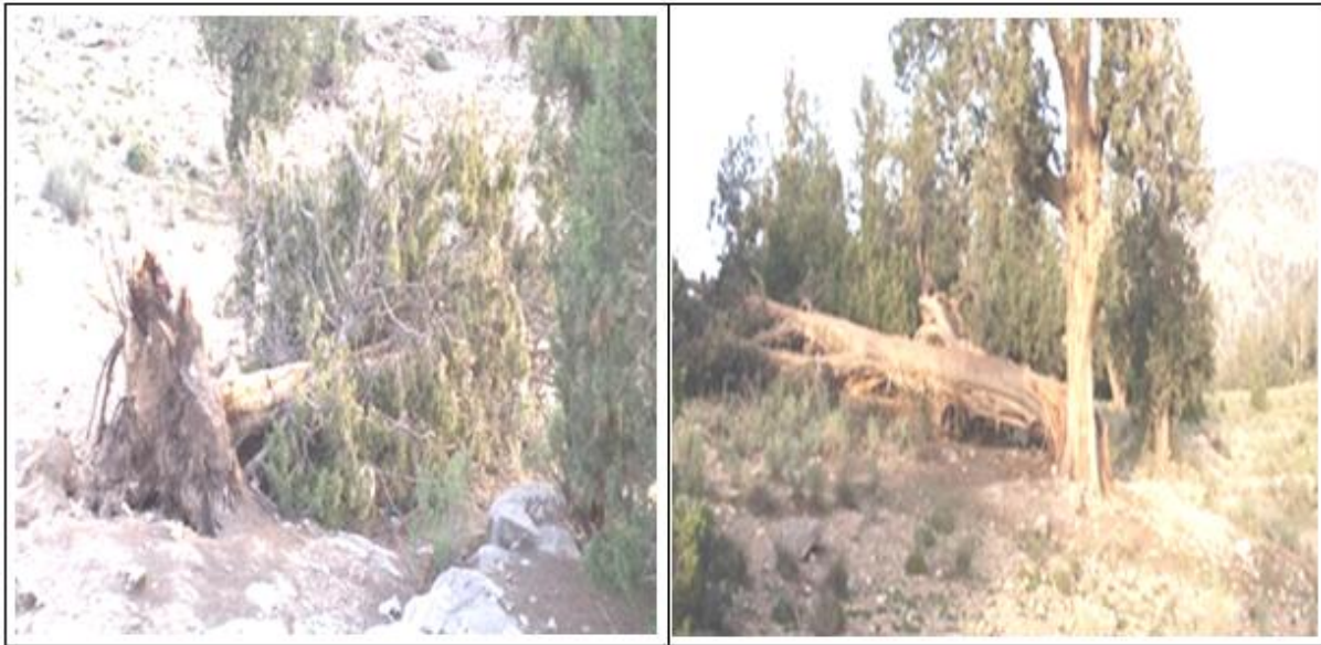
Fig. 1. Showing partial and complete damage caused by the storm to the Juniper trees at Khandisar Ziarat.

Sapoongarsasanak. There was no damage to the Juniper trees. The area of Manna dame including Norekshela, Masoorisasanamanna, Mulasaleemsakhobi and Kawasneka graveyard were visited and moderate scale damage was observed. Nearly 18 trees were damage by the wind in these areas. The Chowtair Range was investigated.