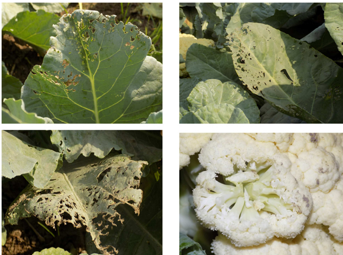
Fig. 2. Effected leaves and Head (Fruit) of cauliflower.

A unique sampling technique is used to collect samples from different fields of cauliflower by inspecting leaves, stems and head of cauliflower thoroughly. We collected most of the samples from 204 R.B village. Fig. 2. After collection, samples are brought in the laboratory of department of Zoology, Wildlife and Fisheries, University of Agriculture Faisalabad for the identification of pests by expert entomologist Fig. 3.