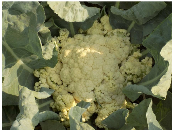
Fig. 4. Brassica Oleracea (Cauliflower).

Our focus is to study the effect of pests on cauliflower field. There for our study material is Brassica Oleracea (Cauliflower) Fig. 4.