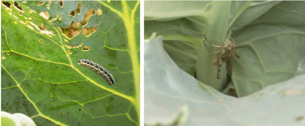
Fig. 3. Pieris brassicae (American Sundi) attached with leaf of cauliflower (Right Picture) while grasshopper attached with stalk of cauliflower (Left Picture).