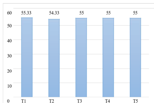
Fig. 1. Number of Days to 50% Flowering.

The flower of the crops is an indicator of growth of plants thus number of percentage of flowering encourages more production. The plants started to bear flowers at 35 days after transplanting and achieved fifty percent flowering at 55 days after transplanting. However no significant difference was observed among treatments tested based on the analysis of variance on the number of days to 50% flowering.