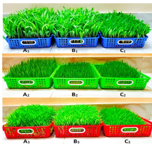
Fig. 1. Influence of hydroponic nutrient media on three green fodders. A 1 -A 3 : Cooper, B 2 -B 3 : Hoagland & Arnon, C 1 -C 3 : ACI Vitamix. A 1 -C 1 : Maize, A 2 -C 2 : Wheat, A 3 -C 3 : Sudan grass

Treatments sharing the same letter are not significantly different from each other, while treatments with different letters are significantly different. In this study, the highest fodder length was observed in the Cooper × Maize combination (29.62 cm), labelled with the letter 'a', indicating superior performance compared to other combinations. This suggests that maize grown in Cooper nutrient media exhibited the most robust growth in terms of fodder length (Fig. 1). On the other hand, the lowest fodder length was observed in the ACI Vitamix × Sudan grass combination (11.58 cm), labelled with the letter 'g'.