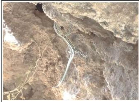
Fig. 20. Apathya cappadocica urmiana near Shera Swar cave entrance.

They concluded that A. c. urmianais present at altitudes of more than 1000 m a.s.l. Ilgaz et al. (2010) examined urmiana subspecies at molecular level and found it has own special electrophorenograms. This result put in mind some possible adaptation of this subspecies to life in cave. This beautiful lacertid lizard found in most caves north of Erbil.