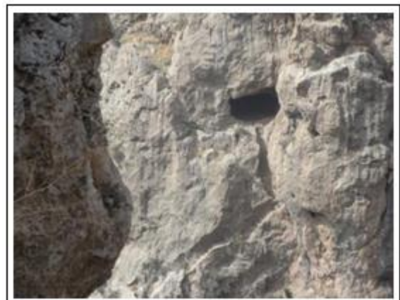
Fig. 12. The Ashcawte (Cave) Gawaran.

Ashcawte Gawaran: (fig. 12): it is a mysterious cave and there is an old stair way about 50 meters high from the 1 st step to its entrance. Its history is still debate and doubtful, but somebody believed that it is a place of prayer and contains place of Zardashte old religions (Afrasiab et al. , 2013).