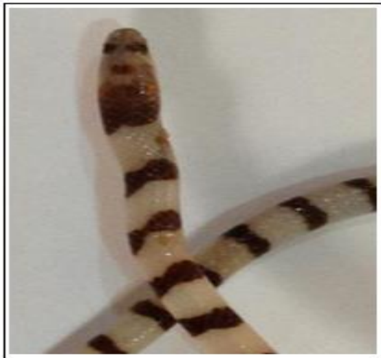
Fig. 24. Eirines persicus snake.

The avian species in this study comprises 21 species and thus represents the most diverse group belonging to 6 orders, 10 families, and 17 genera.