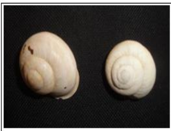
Fig. 18. Land snail Sphincterochila boissieri , dorsal view.

Lewis (2001) reported 4 species belong to genus Scolopendra from the mountainous area in Iraqi Kurdistan namely: Scolopendra cingulata , S. canidens , S. mirabilis and S. valida . He reported the present species Scolopendra mirabilis (fig. 17) from Penjwin, Sulaimaniya, Zakho and Gali Alibek in Erbil.