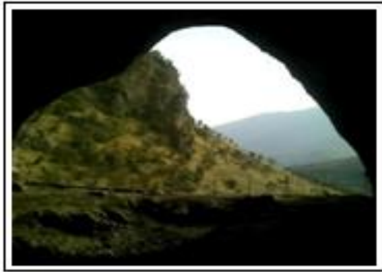
Fig. 4. Shanidar cave, inside view.