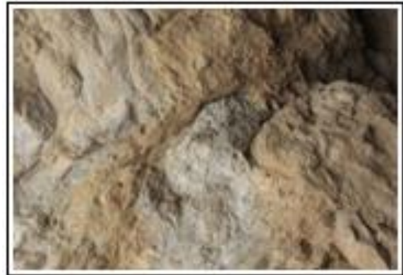
Fig. 2. Shera Swar cave, inside view.

The roof covered by black bituminous materials that penetrated via joints and fractures. On June 2015 temperature was 42 °C outside the cave, 38 °C at the entrance, and 36 °C inside of the cave. There are no water pools inside the cave. (Figs. 1-2):