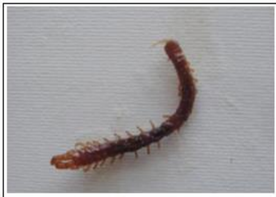
Fig. 17. The chilopod Scolopendra mirabilis .

specimens also because of the intense visits of tourists from inside and outside Iraqi Kurdistan for several months as "tourism season" may extend for 7-8 months or even more leading to killing and disappearing the scorpions. Buthacus leptochelys (fig. 9) was recorded in Tel Afar and Makhmoor in the north of Iraq (Bringle, 1960; Khalaf, 1962; Khalaf, 1963). Scorpio maurus (fig. 10) was frequently reported from the north of Iraq, Bringle (1960), Khalaf (1962), and Khalaf (1963) recorded it in Duhok-Aqra region, Diana-Rwandoz region, Tel Afar, and Serseng in the north of Iraq. It was also reported from Rutba in the west of Baghdad and Abou-Saida in the middle (Khalaf, 1962).