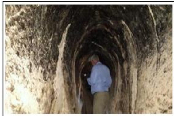
Fig. 11. Sarkerdayate cave, a view inside a small branch of the cave.

Hamashowana: it is also called sanctuary of Bawanawes, and it is very important cave because its includes Stone Age paints belong to Archaic- Homo sapiens , more than 30,000 years B. P., according to S. R. Afrasiab who excavate it (Afrasiab et al. , 2013).