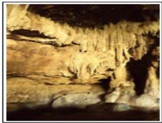
Fig. 9. a stalactite in Beeston cave.

The dimensions of the large one are: width of 1 st hall entrance is about 12-15 meters, the width of 2 nd hall entrance is about 25 meters, and interior width is about 6-9 meters, and the high is about 2-10 meters.