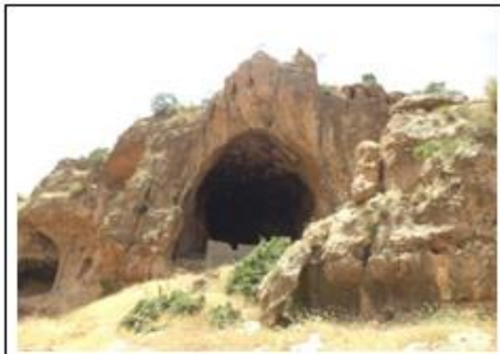
Fig. 10. Sarkerdayate cave, outside view.

On June 2015 temperature was 38 °C outside the cave, 30 °C at the entrance, and 21 °C and relative humidity 36% inside of the cave. There are no water pools inside the cave. (Figs. 10-11).