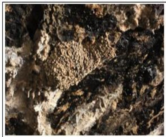
Fig. 28. Nest of the red rumped swallow Hirundo daurica .

On the other hand, studied caves witness intense turnout of tourists, except for Beeston cave, that disturb their fauna and put threat pressures and may lead to poorer animal life. These pressures seem severe in Sarkerdayate cave and for a lesser extent for the other caves.