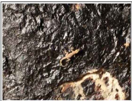
Fig. 21. Assacus griseonatus in Sarkerdayate cave

Assacus griseonatus (fig. 21) was recorded in northeast Iraq (Afrasiab & Mohamad, 2009; Parash et al. , 2009). It was recorded in this study from all caves. It was very common in Sarkerdayate cave.