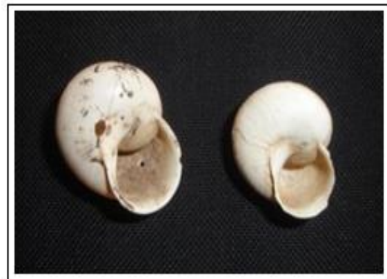
Fig. 19. Land snail Sphincterochila boissieri , ventral view.