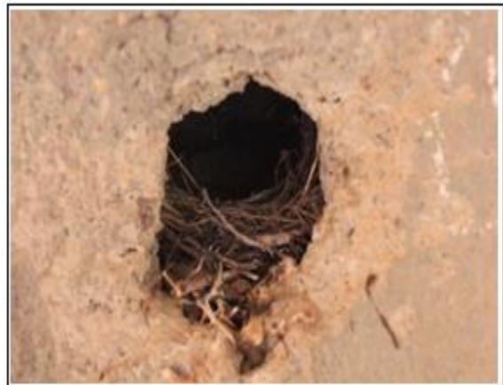
Fig. 26. nest of the common wheatear O. oenanthe

The birds recorded from caves in this study include a good deal of birds of prey comprising 6 species. Order Passeriformes constitute the most diverse group of birds in this study with 10 species.