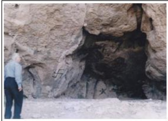
Fig. 13. Hazar Merd cave entrance.

about 12 kilometers south west Sulaimaniyah City and the coordinations are: 35° 29' 38.66" N and 45° 18' 38.96" E. It is group of caves but the largest one named Hazar Merd, Which has 30X20X10 meters, length, width and high respectively and it is related to Paleolithic period.