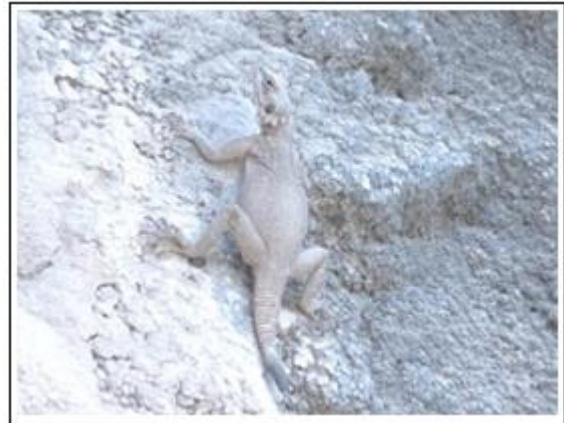
Fig. 22. Laudakia nupta at Sarkerdayate cave.

Eryx jaculus (fig.23) is a non poisonous Boidae snake found in Beeston cave, north of Erbil. It is probably searching for the bird nests and for bats.