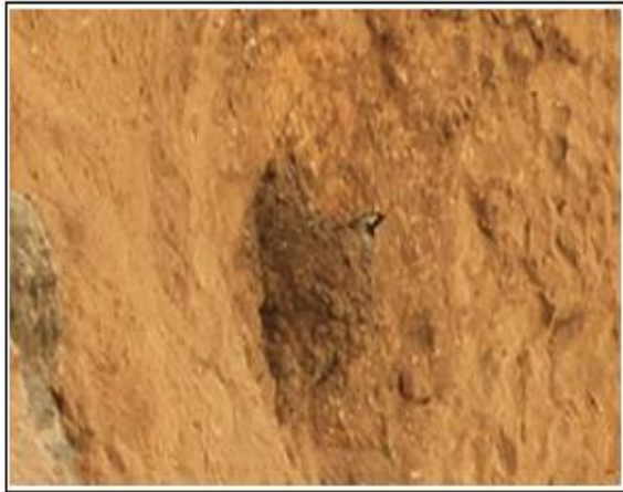
Fig. 27. a male sparrow sitting in the nest of another bird.

same author talking about his finding on Rhinolophus eurayle , wrote that it is highly probable that these bats spend the winter in the southern caves to avoid the freezing cold weather of the north. This assumption may be true also for our bat as they belong to the same genus. Another survey will definitely reveal more species of bats in Iraqi Kurdistan caves.