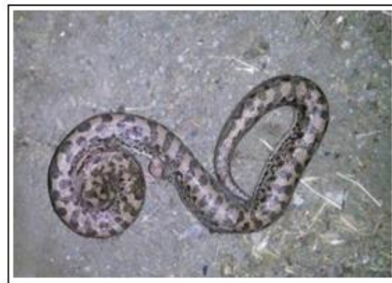
Fig. 23. Eryx jaculus snake from Beeston cave.

The snake Malpolon monspessulana insignitus is recognized by its uniform grass green dorsals. It enters caves at the time of bat migration. It was found at Hawraman caves.