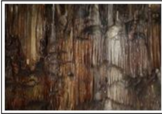
Fig. 8. Another stalagmite in Beeston cave.