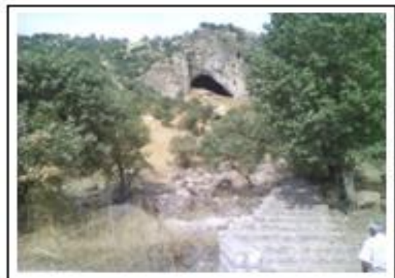
Fig. 3. Shanidar cave, outside view.

It is located on the south-west limb of Bradost anticline, within carbonate rocks of Qamchuqa Formation. The coordination of the cave is: 36° 50' 05" N, 44° 13' 09" E. On June 2015 temperature was 40 °C outside the cave, 36 °C at the entrance, and 29 °C inside of the cave. There are no water pools inside the cave. Shanidar cave is well-known worldwide for Neanderthal skeletons (c. 60,000 years ago) found here as in the late 1950s, archeologist Ralph Solecki and his team unveiled four cultural layers within this cave (Stevanovic et al. , 1999) (Figs. 3-4).