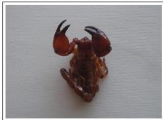
Fig. 16. Scorpio maurus , dorsal view.

It could be assumed that this finding correlated with presence of the rock doves which use the cave as roosting place and this association between them lead to record both of them from the same cave. However, rock pigeon was reported to present in another two caves in the present study (Shanidar and Sarkerdayate) without collecting this tick. This may be because that the roosting places for pigeons in latter caves are much higher and could not be accessible for us to collect tick specimens.