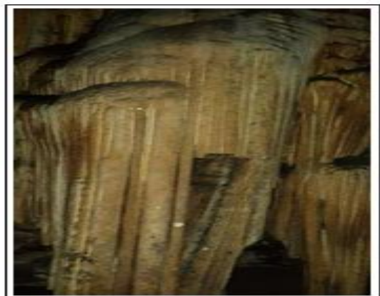
Fig. 7. a stalagmite in Beeston cave.

Sarkerdayate in Kurdish means the main or large cave. They are located on the west side of Chemi Razan valley within massive carbonate rocks of Sinjar Formation. Its coordination's are: 36° 23' 693" N, and 44° 17' 127" E, and the altitude about 888 meters a.s.l..