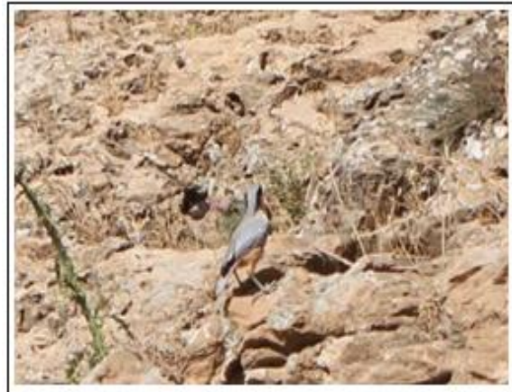
Fig. 25. Sitta europaea at the entrance of SheraSwar cave.

The birds recorded from caves in this study include a good deal of birds of prey comprising 6 species. Order Passeriformes constitute the most diverse group of birds in this study with 10 species.