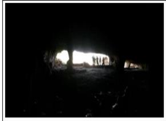
Fig. 6. Beeston cave, inside view.

of water pools which is located about 100-200m inside the cave was 11 °C. The depth of the pools ranges 10-15 centimeters. The water pools are formed from the dripped water beneath the rocks forming the roof of the cave. The low temperature of water may inhibit presence of some animal life. (Figs. 5- 6).