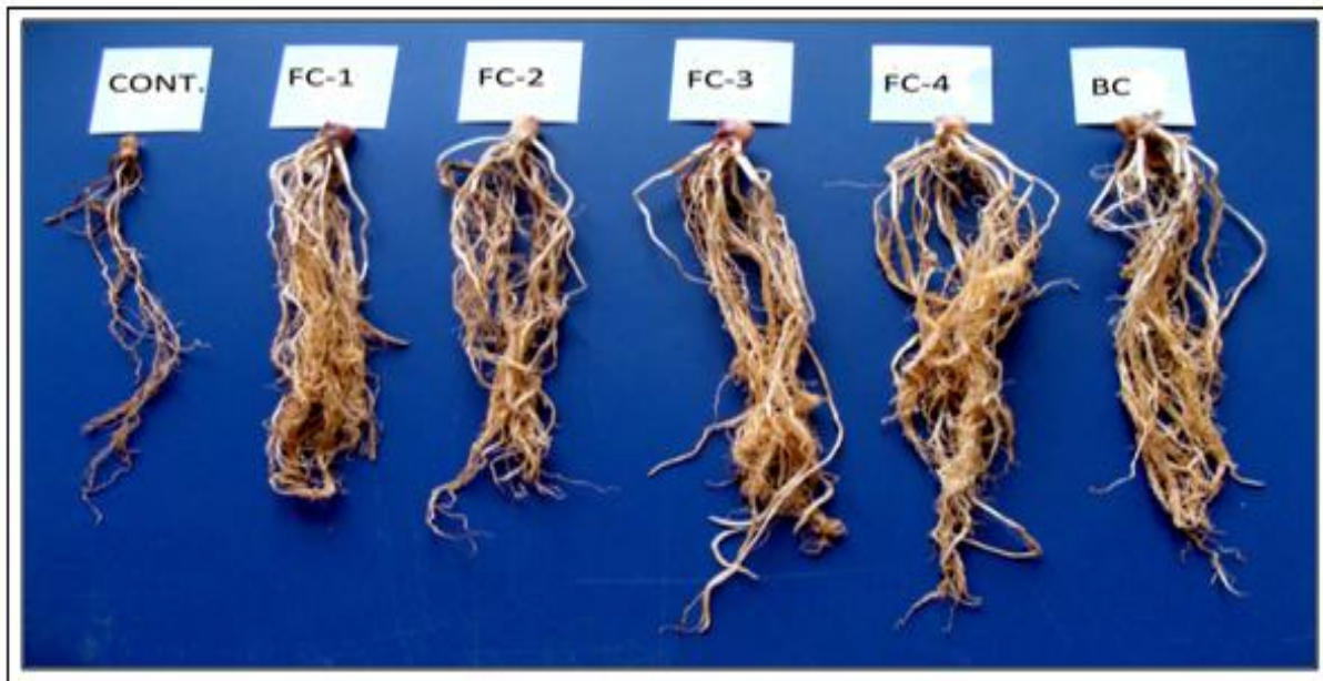
Fig. 2. Effect of different inoculated carriers on growth of maize root.

nutrients which exhibit significant impact on crop growth. Plant growth promoting rhizobacteria inoculated maize crop significantly increase plant weight, plant height and nutrient uptake i.e N, P, K, Fe, Cu, Zn and Mn (Jarak et al. , 2012).