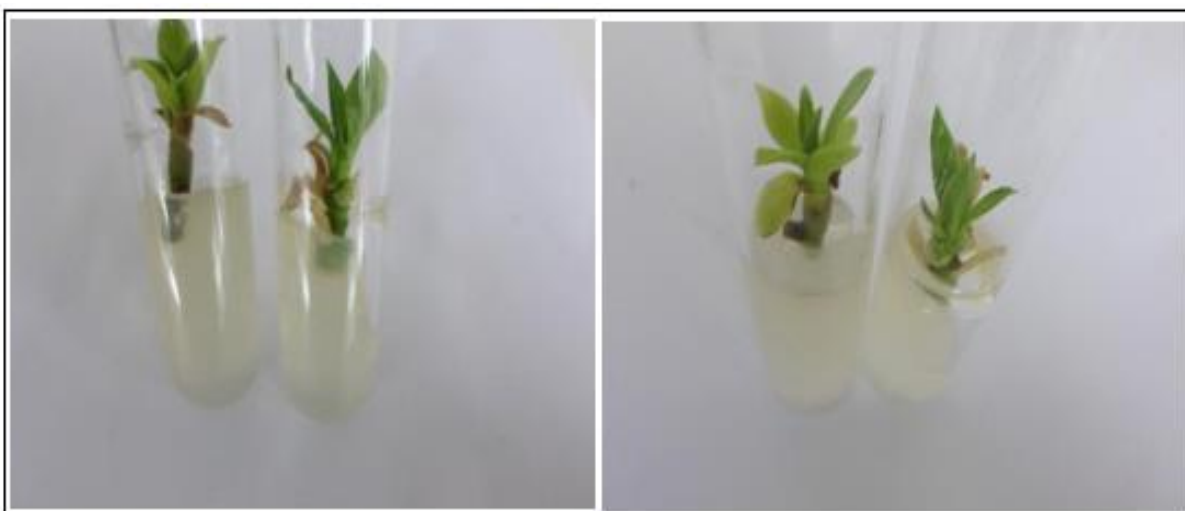
Fig. 5. Skimmia laureola explants showing shoot growth.

The effect of sterilizing agents on growth of explants was recorded after 14 days of culturing (Table 3). The significantly ( P \leq 0.05 ) maximum shoot length (2.24cm) was observed in treatment T4 (0.5% HgCl 2 for 30 seconds) (Fig. 5) followed by treatment T22 (0.5 % HgCl 2 + fungicide) 1.3 cm shoot length.