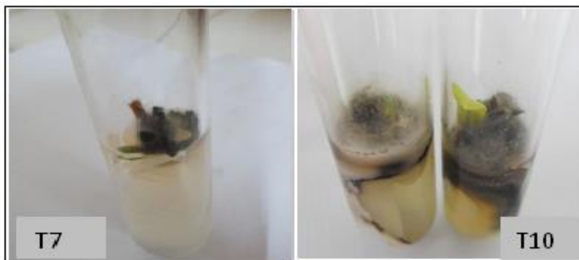
Fig. 1. Treatment T7 (3%NaOCl), T10 (5% NaOCl) showing fungal contamination after 14 days of culturing.

Similarly Treatment T11, T7 and T9 and treatment T13, T14, T15 having 0.1% NaOCl and 3% NaOCl+ fungicide respectively showed 100% shoot survival rate.