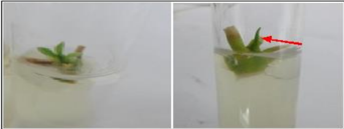
Fig. 2. Skimmia laureola explants showing shoot emergence in treatment T4 (0.5 % mercuric chloride) as after 7 days of culturing.

4) revealed that most of the treatments containing NaOCl as sterilizing agent showed 0% survival rate. According to Ahmed, et al. , (2014) considerable reduction in contamination of explant was obtained by treating the explants with sodium hypochlorite 5% for 10 minutes after rapid rinsing in 70% ethanol for 30 seconds.