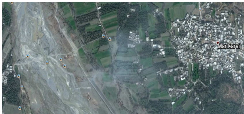
Fig. 1. Map of River Dor at Mankarai Khyber Pakhtunkhwa Pakistan.

A survey was carried out by Usman et al. (2017e) to find out the concentration of heavy metals in Jhanjira Upper site of the River Kabul KP, Pakistan. The results obtained from the current study were in the range of Zn 1.11-1.97 ppm; Cu 1.05-1.63 ppm; Cd 0.11-0.89 ppm; Pb 0.07-1.07 ppm; Cr 0.01-0.11 ppm and Mn 0.02-0.28 ppm respectively. The aim of the current study was to investigate of heavy metals in River Dor at Mankarai Khyber Pakhtunkhwa, Pakistan.