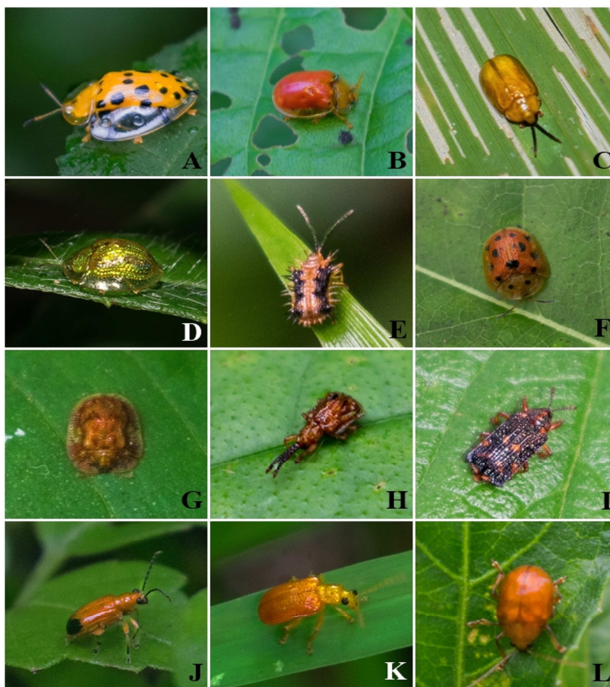
Fig. 3. Subfamily Cassidinae. A. miliaris (A); B. sinuata (B); C. flavescens (C); C. circumdata (D); D. vitulla (E); L. tredecimguttata (F); N. taeniata (G); O. philippinica (H); U. girardi (I). Subfamily Criocerinae. Lema sp. 1 (J); Lema sp. 2 (K). Subfamily Eumolpinae. P. dialatatus (L).

families (Vencl and Leschen, 2014), Two (2) species ( Lema sp. 1 and Lema sp. 2) were collected and associated in the nutrition with P. conjugatum (Poaceae). Lema sp. 3 and Lema sp. 4 were the only species of chrysomelids that were collected without any plant association in this study. Most species of Eumolpinae (Fig. 3) are attracted on latex plants (Asclepiadaceae and Apocynaceae) (Jolivet and Verma, 2008). P. dialatatus which represents the only eumolpine species in the study was collected from Barringtonia sp. without any feeding activity observed. Species found in this study with new plant association serves as a baseline data. This requires more detailed observations, critical food selection experiments, and food preference studies in the field and under laboratory conditions for a possibility of new host plant records.