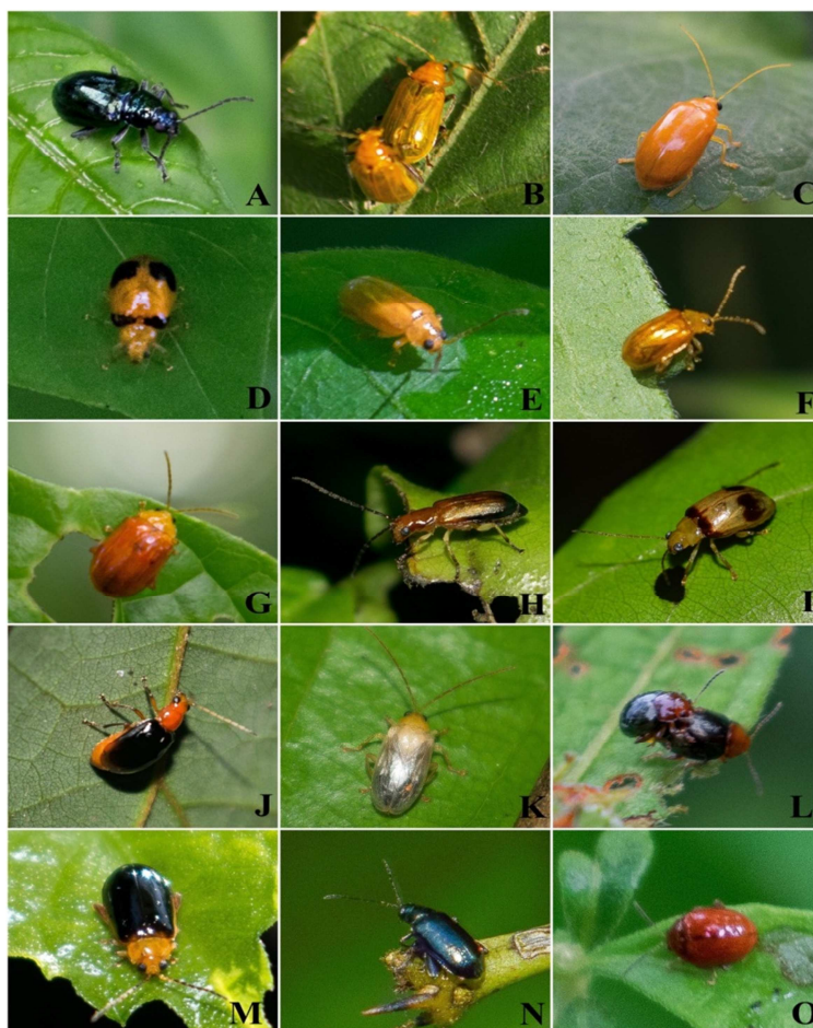
Fig. 2. Subfamily Galerucinae. A. cyanea (A); A. indica (B); C. unicolor (C); Dercetina sp. (D); Erganoides sp. (E); Hemipyxis sp. 1 (F); Hemipyxis sp. 2 (G); H. cavifrons (H); M. bifasciata (I); Monolepta sp. 1 (J); Monolepta sp. 2 (K); N. gemella (L); Philopona sp. (M); Phyllotreta sp. (N); Sphaeroderma sp. (O).

Species from these genera were mostly collected on families Adoxaceae, Asteraceae and Onagraceae. N. gemella was observed feeding on U. lobata (Malvaceae) in large numbers. Philopona sp. was observed feeding on S. asper (Moraceae) and Phyllotreta sp. on E. pungens (Elaeagnaceae), both species were not known to feed on these families. Species from the genus Sphaeroderma Stephens, 1831. are known to be associated with family Asteraceae, Sphaeroderma sp. was observed feeding on Elepanthopus sp.