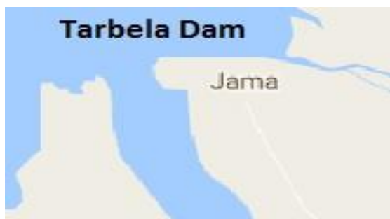
Fig. 1. Map of River Dor at Jama site KP, Pakistan

The Jama station of River Dor is very close to the Tarbela Dam where River enter to the Dam. This point is rich of water bodies and hence found clean as compared to the other points along with the River Dor. Majority of fish fauna was recorded from this point due to water rich zone. Small stones were also found in the bottom of the river of this site. Furthermore, speed of the water was very fast in this site. Sidewise of this point grassy plains were also existing which were too much imported for grassing of castles.