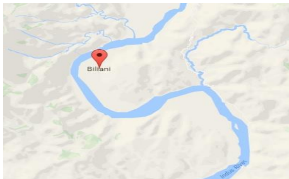
Fig. 1. Map of River Indus at Biliani site Khyber Pakhtunkhwa, Pakistan.

Biliani is very popular site of the River Indus located in Hazara Division Kyber Pakhtunkhwa Pakistan. This point of the river consisting high water bodies. This Area of the River is very wide and speed of the water is also very high. Dominant family over here is almost Cyprinidae fauna. This site is very appropriate for wild life conservation. Most vertebrates and invertebrates fauna is present in this area. For example Jackal, wolf, Porcupine and dragonflies are very popular.