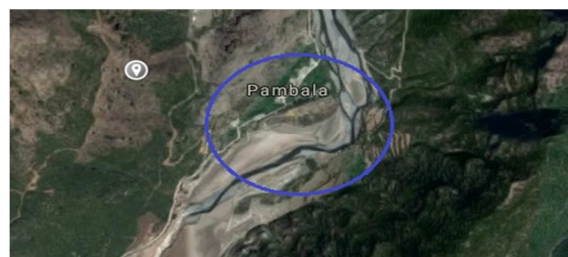
Fig. 1. Map of River Harrow at Pumbala site Khyber Pakhtunkhwa Pakistan.

Pambala sampling site of River Harrow is very beautiful because of its natural greenery and picnic spots. In this site of the river there is no domestic discharged which badly affect the fish population. The water of this sampling site is clear. Water flow in this site is very high. The width of the river Harrow at this site is large.