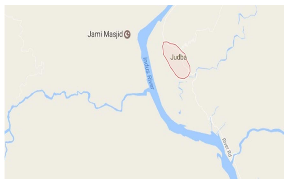
Fig. 1. Map of River Indus at Jubda site Khyber Pakhtunkhwa Pakistan.

Jubda station of River Indus comprising green fields and trees of pines. This site is greatly inhabited by invertebrates and vertebrates fauna. This area is also for hunting of wild fauna. Besides all these this site is very attractive and beautiful. In this site anthropogenic activities are too much which alter water Chemistry.