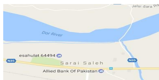
Fig. 1. Map of River Dor at Sarai Saleh site KP, Pakistan.

Sarai Saleh is very imported spot of the River Dor located in Hazara Division Kyber Pakhtunkhwa Pakistan. This site of the river consisting low water bodies. In this point of the River is very narrow and speed of the water is also very slow. Over here almost Cyprinidae fish fauna are existing. This zone of the River Dor is very suitable for other invertebrates and vertebrates fauna. This area is very suitable for wild life conservation. Among the vertebrates wild life fauna Jackal, wolf, Porcupine, Gray partridge, Black Partridge are very popular.