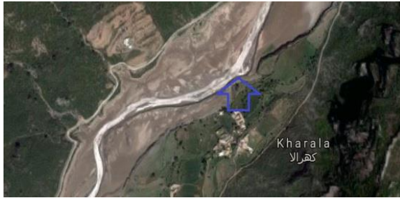
Fig. 1. Map of River Harrow at Kharala site KP, Pakistan. The blue arrow show sampling point of the selected site.