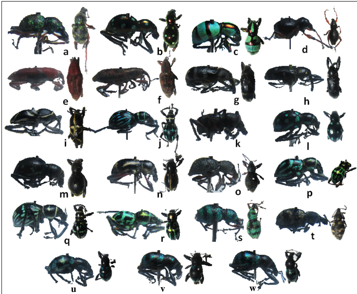
Fig. 2. Weevilsof Marilog Forest Reserve, Marilog District, Southern Mindanao, Philippines. a) Metapocyrtus apoensis , b) Pachyrhynchus erchsoni , c) Pachyrhynchus miltoni , d) Metapocyrtus sp.1 , e) Alcidodes sp.1 , f) Alcidodes sp.2 , g) Alcidodes sp.3 , h) Alcidodes sp.4 , i) Alcidodes sp.5 , j) Metapocyrtus sp.2 , k) Metapocyrtus sp.3 , l) Metapocyrtus sp.4 , m) Metapocyrtus sp.5 , n) Metapocyrtus sp.6 , o) Metapocyrtus sp.7 , p) Metapocyrtus sp.8 , q) Metapocyrtus sp.9 , r) Metapocyrtus sp.10 , s) Metapocyrtus sp.11 , t) Metapocyrtus sp.12 , u) Metapocyrtus sp.13 , v) Metapocyrtus sp.14 and w) Metapocyrtus sp.15 .

There are three(3) species that been identified and verified namely, Pachyrhynchus erchsoni Waterhouse, 1841 (Philippine endemic), P. miltoni Cabras and Rukmane, 2016 (Mindanao endemic)and Metapocyrtus apoensis , schultze, 1925 (Mindanao endemic)(Figure 2).