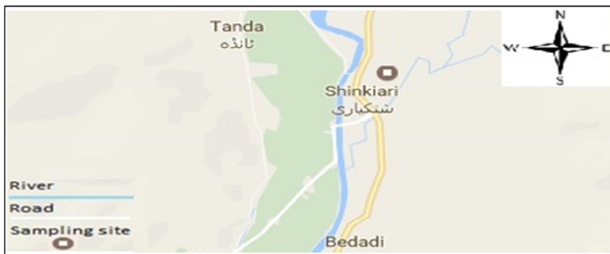
Fig. 1. Map of Shinkhari site in River Siran Khyber Pakhtunkhwa Pakistan.

Shinkhari is situated at River Siran Khyber Pakhtunkhwa, Pakistan (Fig.1). This site of the sampling is impure due to dense populated. In this site all the garbages of the main Shinkhari market enter into the river as a result water quality of this site becomes polluted. In this site a very beautiful bridge is build which is the main passage to cross the river. Furthermore, domesticated waste is also discharge into the river which are badly affected on Ichthyo fauna and other aquatic life. This site is water rich zone that's why this site is also popular for fishing.