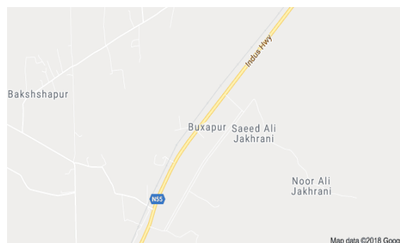
Fig. 1. Map and site of sampling area.

District Kashmore is present in northern area of Sindh and its lies with Ghotki, Jacobabad, Shikarpur and Sukkur within Sindh. District is connected with the borders of Baluchistan on one side and another side with Punjab province. The latitude of Kashmore, Pakistan is 28° 25' 58.78 92" N and the longitude is 69° 35' 1.35 60" E. River Indus flowing therefore along with the Eastern side of Kashmore. Major source of irrigation is through the Guddu barrage and there is excess availability of water in this area due to this fish is to be considered as a cash product of this area.