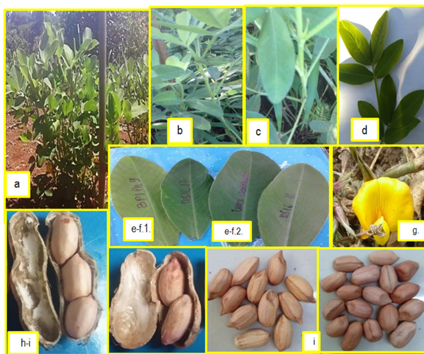
Fig. 1. Typical illustration of different morphological characteristics in peanut: (a) erect growth habit in Luna Seeded; (b) presence of stem pigmentation in BPI Pn 9; (c) glabrous stem hairiness in NSIC 11; (d) opposite leaflets; (e) leaflet shape ( e.1) lanceolate to (e.2.) elliptic; (f) leaf color ( f.1.) light green to dark green; (g) yellow orange color of the flower; (h) prominent to moderate pod beak and pod constriction; (i) pink to tan bean color.

The above discussion suggests that growth habit is not a discrete character, and its inheritance is complex. Several loci interacting among themselves