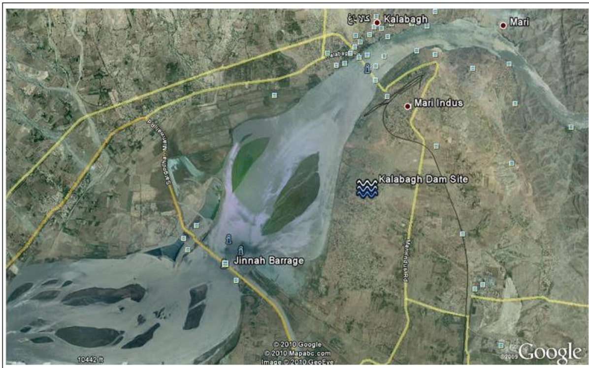
Fig. 1. Satellite map of jinnah barrage.