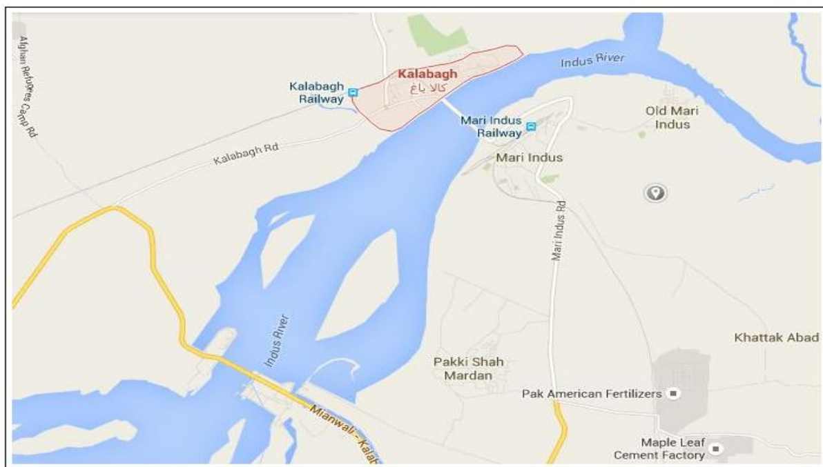
Fig. 1. Map of Kalabagh, District Mianwali Punjab, Pakistan.

Kalabagh is the popular site of proposed Kalabagh Dam and is situated in the West of Punjab province in District Mianwali as shown in the Fig. 1. The present study was carried out from March 2017 to August 2017.