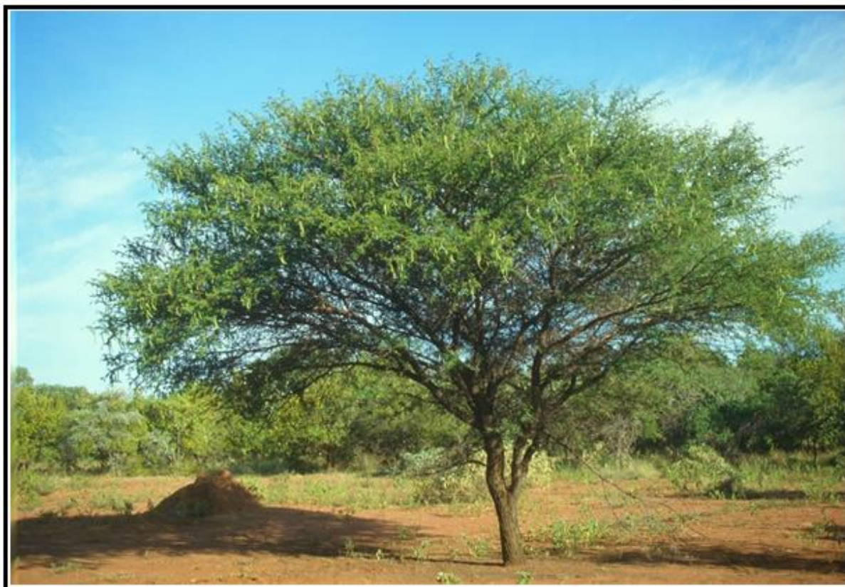
Fig. 1. Acacia nilotica .

being removed from OP exposure is very crucial in order to resolve the over accumulation of ACh in both control and treated group. Results of this present study shows that there is a sex variation which indicates that the female sex group is at higher risk to be affected by OPs compared to the male mice, similar statement as reported by Comfort & Re, (2017) and Ngowi et al. , (2017).