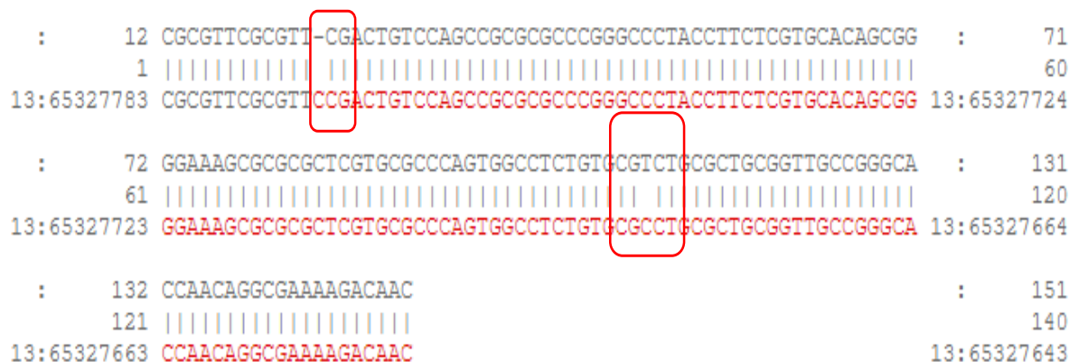
Fig. 3. SNPs identification through Sequence alignment of the bovine UQCC gene.