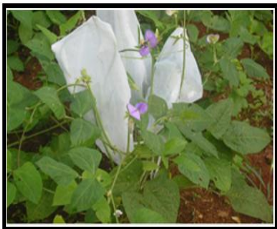
Fig. 1. Plants of Vigna unguiculata showing flowers isolated from insects.

The corresponding figures were 4.88%, 14.03% and 3.64% in 2017, respectively. For the two cumulate years, the numeric contributions were 7.20%, 18.81% and 3.10% for the fruiting rate, percentage of fruits with seeds and the percentage of normal seeds, respectively. The impact of pollinating insects on fruits and seeds yields was positive and significant.