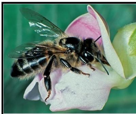
Fig. 2. Apis mellifera collecting nectar in a flower of Vigna unguiculata .

Third, the comparison of the percentage of normal seeds showed that the difference was significant between treatment 3 and treatment 2 in 2016 ( \chi^2=4.26 ; df=1 ; P<0.05 ) and highly significant in 2017 ( \chi^2=9.73 ; df=1 ; P<0.01 ) respectively. For the two years, the pods produce by flowers bagged and visited exclusively by A. mellifera have more normal seeds than those of protected flowers.