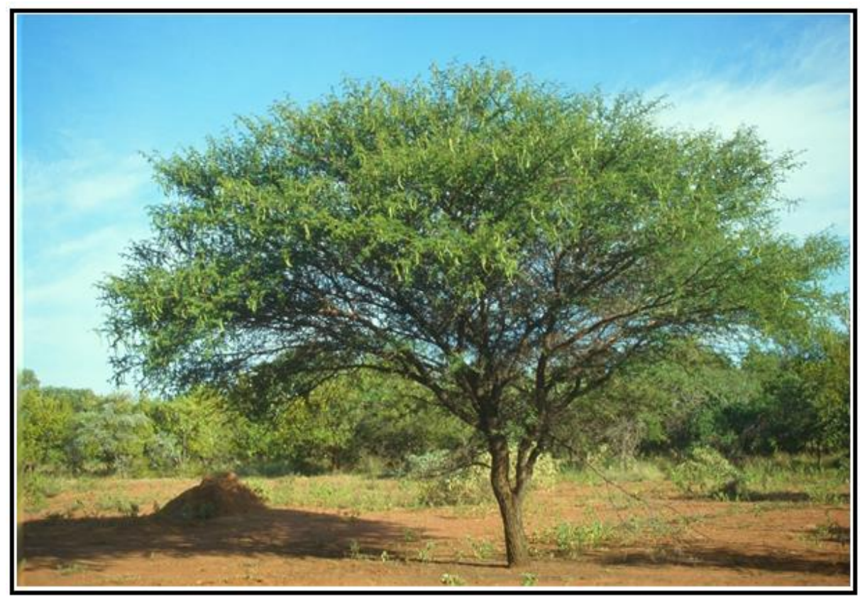
Fig. 1. Acacia nilotica.

being removed from OP exposure is very crucial in order to resolve the over accumulation of ACh in both control and treated group. Results of this present study shows that there is a sex variation which indicates that the female sex group is at higher risk to be affected by OPs compared to the male mice, similar statement as reported by Comfort & Re, (2017) and Ngowi et al. , (2017).