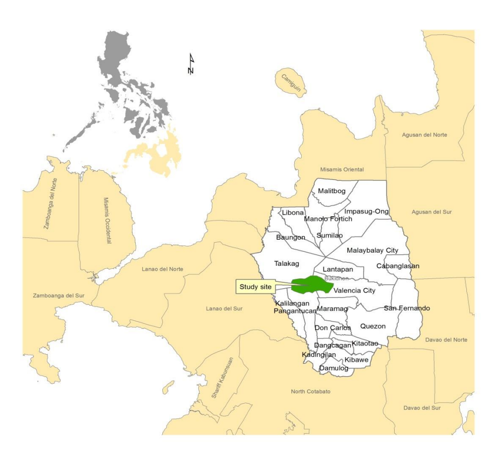
Fig. 1. Location map of the study site.

National Power Corporation. Mt. Kalatungan falls under the Type III climate which is characterized as having short dry season lasting only one to three months and no very pronounced maximum rain period. Average temperature is 24.7 °C. The area receives the highest amount of rainfall in the month of June while the driest month is March. The relative humidity varies from 71% in May to 86% in September. The area is virtually cloud-covered throughout the year.