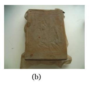
Fig. 2. Boxes containing maggot uncovered (a) and covered (b) with a 1mm mesh cloth for laboratory rearing.