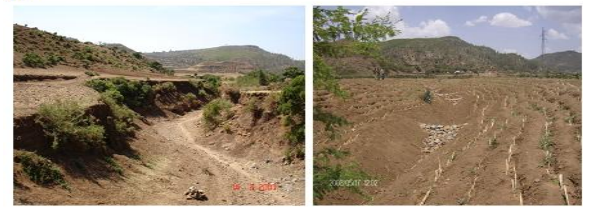
Fig. 4. Partial view of the present land feature in some part of the study area, 2011.

Fig. 3. Partial view of conservation efforts in the study area, GTZ-SUN project Tigray, Ethiopia, 2007.