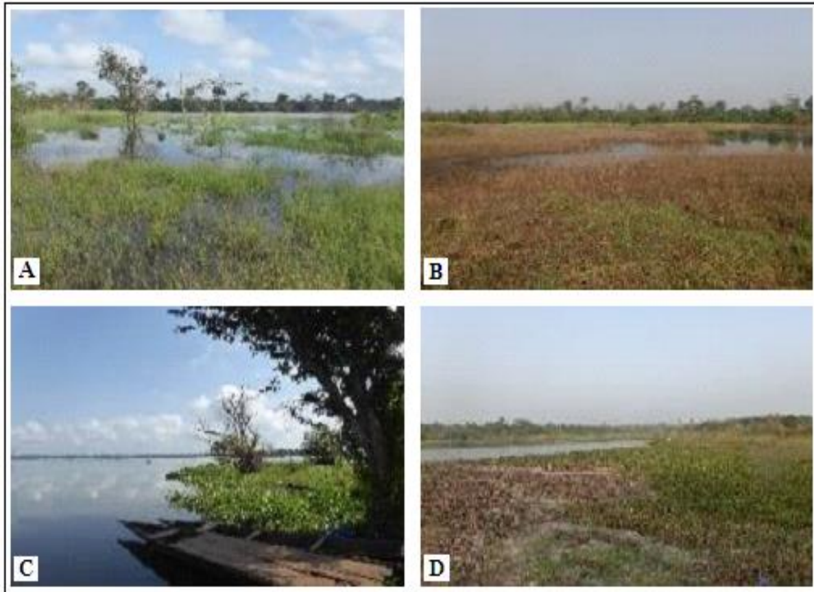
Fig. 2. Partial views of the few bird watching sectors according to the seasons (A: South-East sector in the rainy season; B: South-East sector in the dry season; C: North-East sector in the rainy season; D: North-East sector in the dry season).

These results are consistent, at least in terms of the representativeness of the different bird families according to Odoukpé et al. (2014) and that of the orders according to Koné et al. (2020). Indeed, these authors respectively showed that the Ardeidae family (13 species) was the most represented in the Grand-Bassam wetland and the Charadriiformes order (22 species) was the most diversified in the Ebrié lagoon. However, these data are different from those of Ouarab et al. (2018) in the Oued wetland in Algeria, which states that the Anatidae family was the best represented.