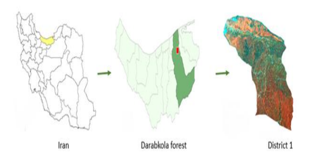
Fig. 1. location of study area in Mazandaran province (north of Iran).

stands based on our plot measurements ranged from 131 to 643 m3 ha-1.