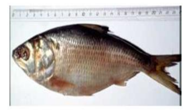
Fig. 1. Bonga fish (Ethmalosa fimbriata).

could be explained by the fact that the gills of fish are important organs in the phenomena of respiratory gas exchange are also richly vascularized and therefore constituted a center of concentration of microorganisms (Degnon et al. , 2013). It would be better to use the headless fish in feed formulation for children as done in this work.