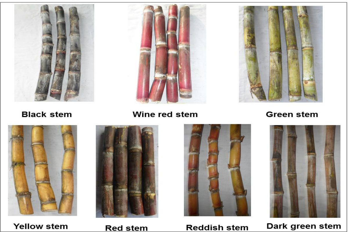
Fig. 1. Different varieties of sugarcane.

Apart from alkaloids, phenolic compounds have been found to possess anti-inflammatory, oestrogenic and antimicrobial properties (Okwu, 2004). The identification of these compounds in sugar cane juice and bark confirms the findings of Uchenna et al. (2015) that the bark extract of sugar cane has bactericidal activity and could be used in the control and treatment of bacterial infection. Edeoga et al. (2006) showed the importance of Hyptis suaveolens and Ocimum gratissimum in the pharmaceutical industry due to their steroid composition which has been found to have a relationship with compounds linked to sex hormones. The identification of steroids in the sugarcane varieties could justify its use. According to Makemba Nkounkou et al. (2017), alkaloids, flavonoids, terpenes and steroids contained in extracts of Anchomanes difformis significantly decreased frequency of spontaneous uterine contractions in guinea pigs. These phytochemicals have varying properties and therefore synergistically (Allangba et al., 2016); their presence in sugarcane juices and bark extracts could justify its use in in traditional medicine preparations for to treat painful rules, miscarriages and sexually transmitted diseases