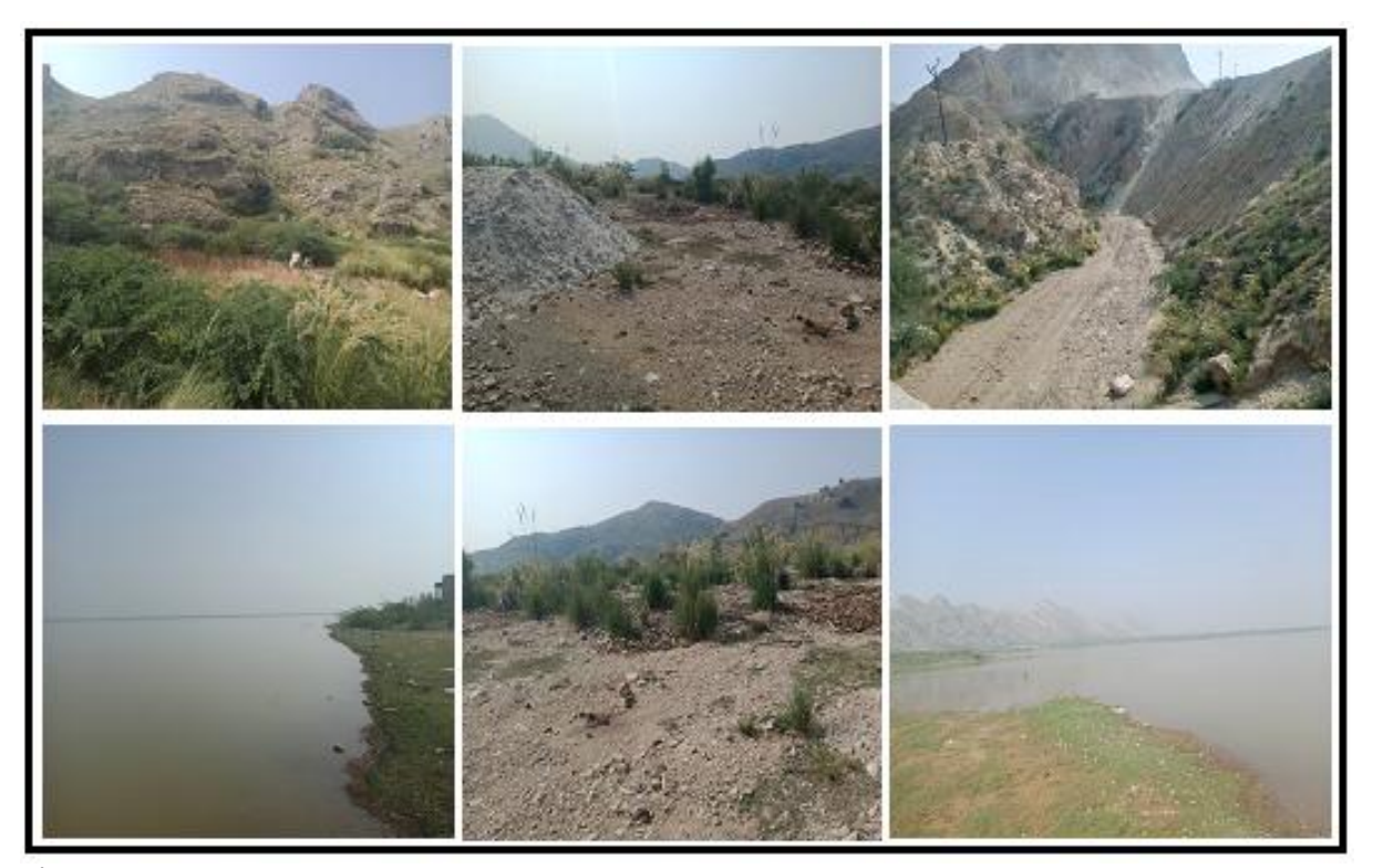
Fig. 1. Habitat of the Namal Valley Mianwali.

Withania coagulens and Zanthoxylum armatum are commonly occurring plant of the salt range (Ahmad et al., 2002).