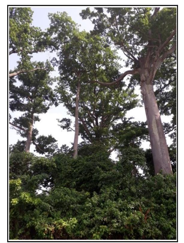
Fig. 2. Natural forest reserves

All these crops involve a total of 324 farmers, 80% of whom are the workers of SUCRIVOIRE and their production, for major crops such as cashew, cocoa and rice, are included in Table 4.