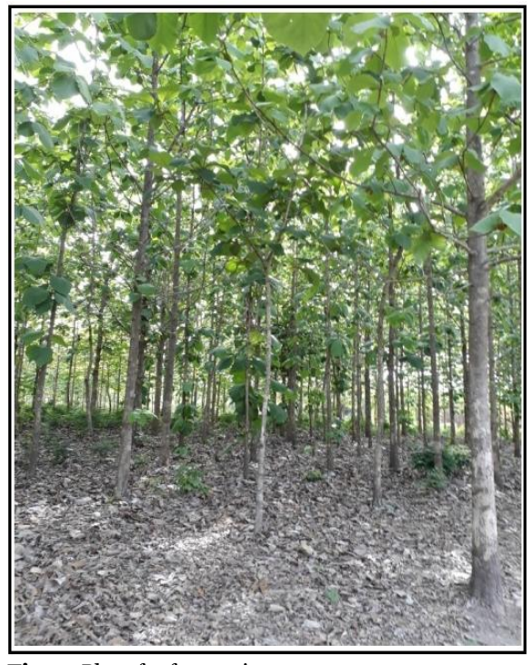
Fig. 3. Plot of reforestation.

An economic approach to these productions has been adopted and the economic analysis is also reported in Table 4.