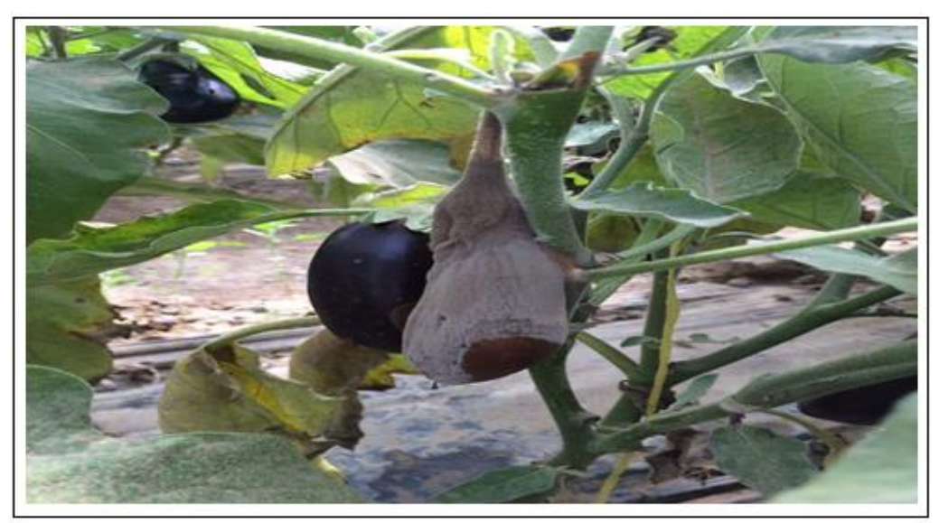
Fig. 1. Symptom of gray mold disease caused by Botrytis cinerea on eggplant fruits.

with Chitosan and Salicylic acid. The application of SA+Chitosan combination, 7 days before inoculation of BC3 isolate was found the more effective, with disease severity 4.23% compared with 55.61% in control (Fig 3).