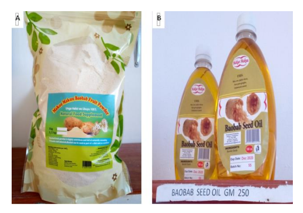
Plate 1. Processed baobab products in Central Tanzania: (A) Baobab powder extracted from fruit pulp, (B) Baobab oil extracted from seed.

In protected areas, elephants utilize baobab, especially in times of resource inadequacy (Owen-Smith, 1988; O'Connor et al. , 2007; Hayward and Zawadzka, 2010; Biru and Bekele, 2012). A study by Barnes et al. (1994) found that baobab densities declined due to elephant browsing in Ruaha National Park. Baobab trees were also slightly affected for the same reasons in Lake Manyara in 1969 and 1981 (Owen-Smith, 1988). During this period, only 13% of the trees remained undamaged, but the annual tree mortality stood at 1% per annum (Owen-Smith, 1988). There is a need to conduct a study on the impact of elephants on baobab population structure in protected areas.