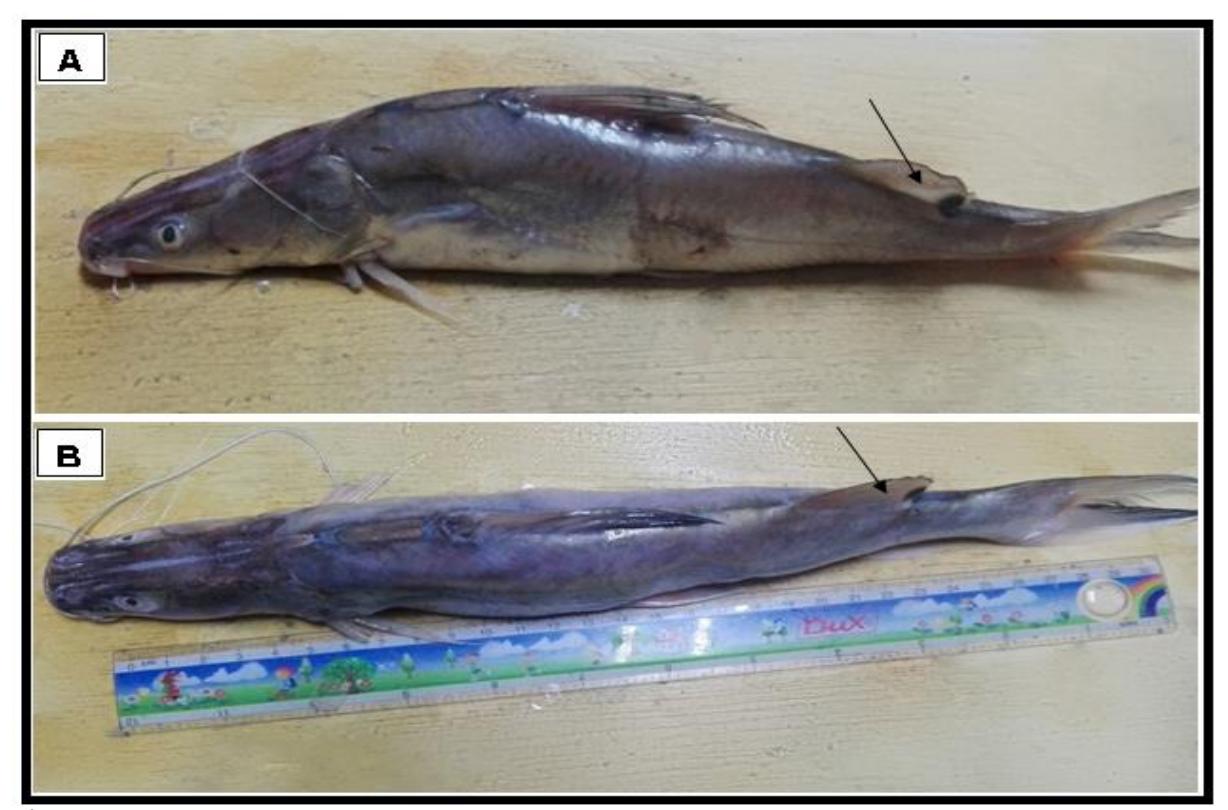
Fig. 1. The specimen of S. sarwari collected from the upstream (A) and downstream (B) of Head Tarimue (River Chenab) showing light and dark colour in upstream specimen and dark colour in both specimens (upstream A and downstream B) in adipose fin with black margin and black spot.

on the adipose fin, while black spot was present on the posterior side of the fin. Overall, the populations of S. sarwari collected from the river Chenab, Jhelum, Ravi and Indus showed variations in the body colour and adipose fin. The variation in the body colour could be due to the variable environment.