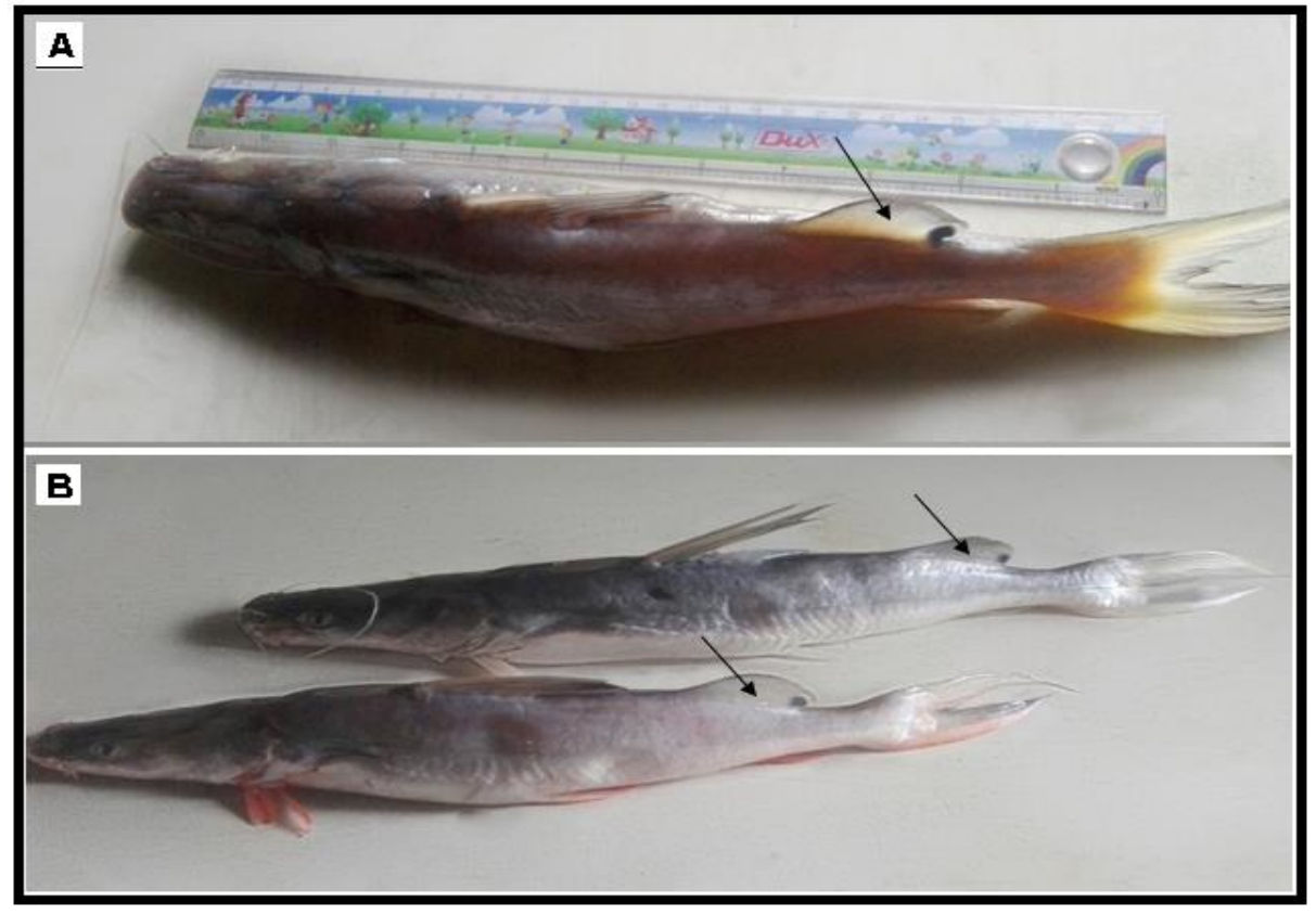
Fig. 2. The specimen of S. sarwari collected from the upstream (A) of Head Rasul (River Jhelum) showing brown and light gray colour in adipose fin with dark gray margin and black spot. While, in downstream (B) showing black spot and light gray colour in adipose fin with no definite light gray margin.

In this study we observed that physical environment like nutrition, temperature, water current, water depth and turbidity was encountered with adaptations of morphological characters causing colour variation in fish species, which is in good agreement with the previous studies (Wimberger, 1992; Turan et al. , 2005; Wringe et al. , 2015; Akbarzadeh et al. , 2009).