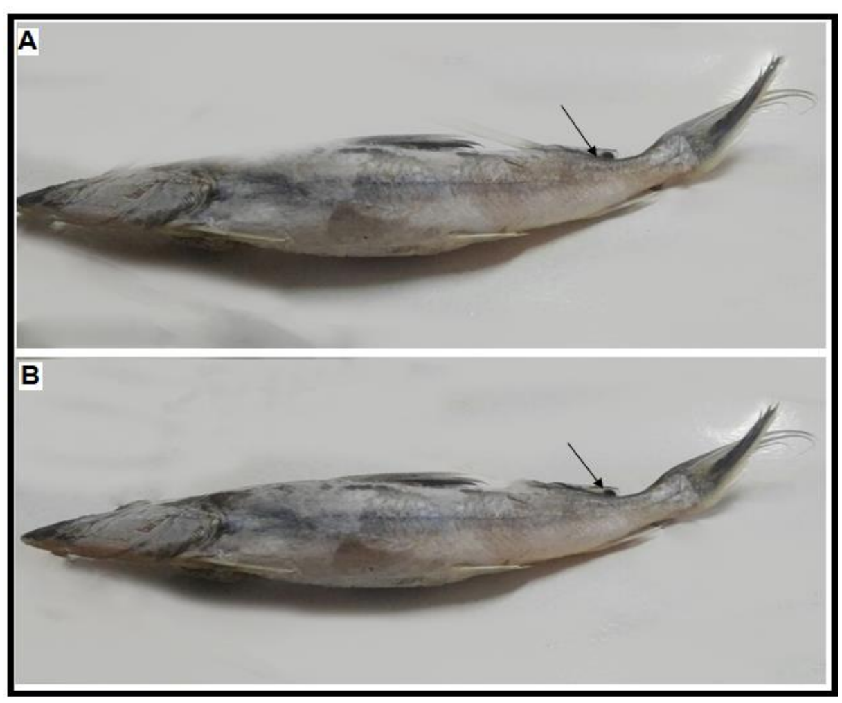
Fig. 3. The specimen of S. sarwari collected from the upstream (A) of Head Baloki (River Ravi) and downstream (B) both showing black spot and light gray colour in adipose fin with black margin.

agreement with the study of Reiss et al. (2012).They investigated that colour variantion of Cichla temensis was not dependent upon the sexual dimorphism, the colour differentiation is secondary sexual character which occurred periodically.