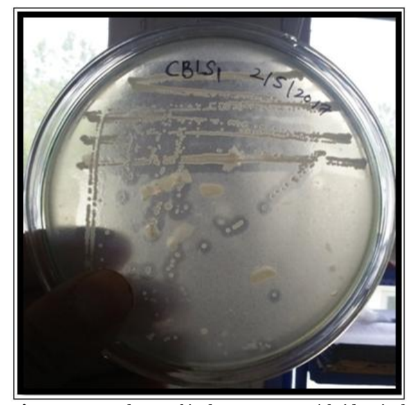
Fig. 4. Pure culture of isolate CBAW2 with identical colonies.

The cultural characteristics interpreted from Bergey's manual of Systematic Bacteriology (Logan et al , 2009) were indistinguishable, hence the isolate could be identified as Bacillus sp .