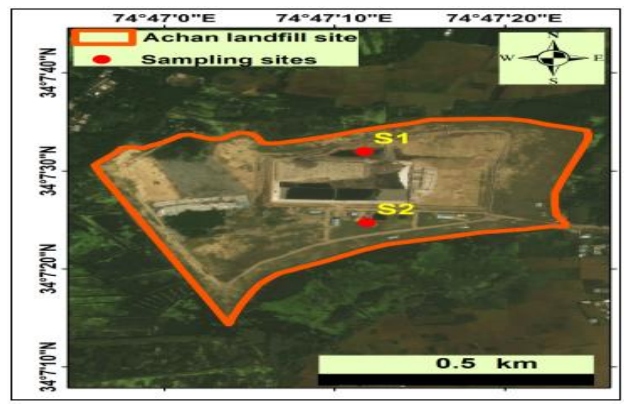
Fig. 1. Location map of Achan landfill site.