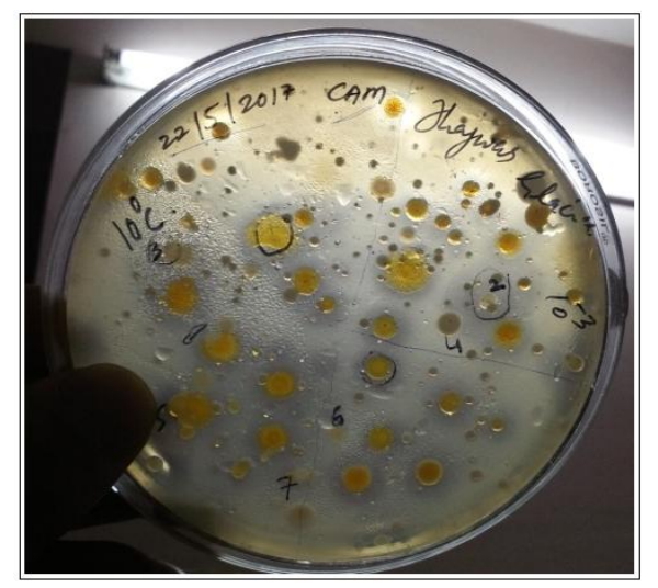
Fig. 2. Isolates forming hydrolysis zone on CMC agar media.

semi fluid nature of the cell membranes for easy transport of materials or enzymes (Sethi et al , 2013). However, the increased CMCase activities of isolates from o to 20°C could be attributed to the psychrotrophic nature of the bacterial isolates and the changes in physical membrane structure with increased temperatures that influences the secretion of extracellular enzymes (Rasul et al , 2015).