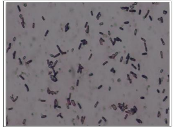
Fig. 5. Results of Gram staining of isolate.

The results of biochemical characteristics of the isolate were also found similar to those demonstrated by Logan et al , 2009) and both the results confirmed it as Bacillus sp. All the biochemical test were not carried due to the limited resources available and hence the genus of the isolate could not be fully determined. However from the previous studies biochemical characteristics identified the bacterial isolates as Bacillus sp. (Rasul et al , 2015; Ahamd et al. , 2013).