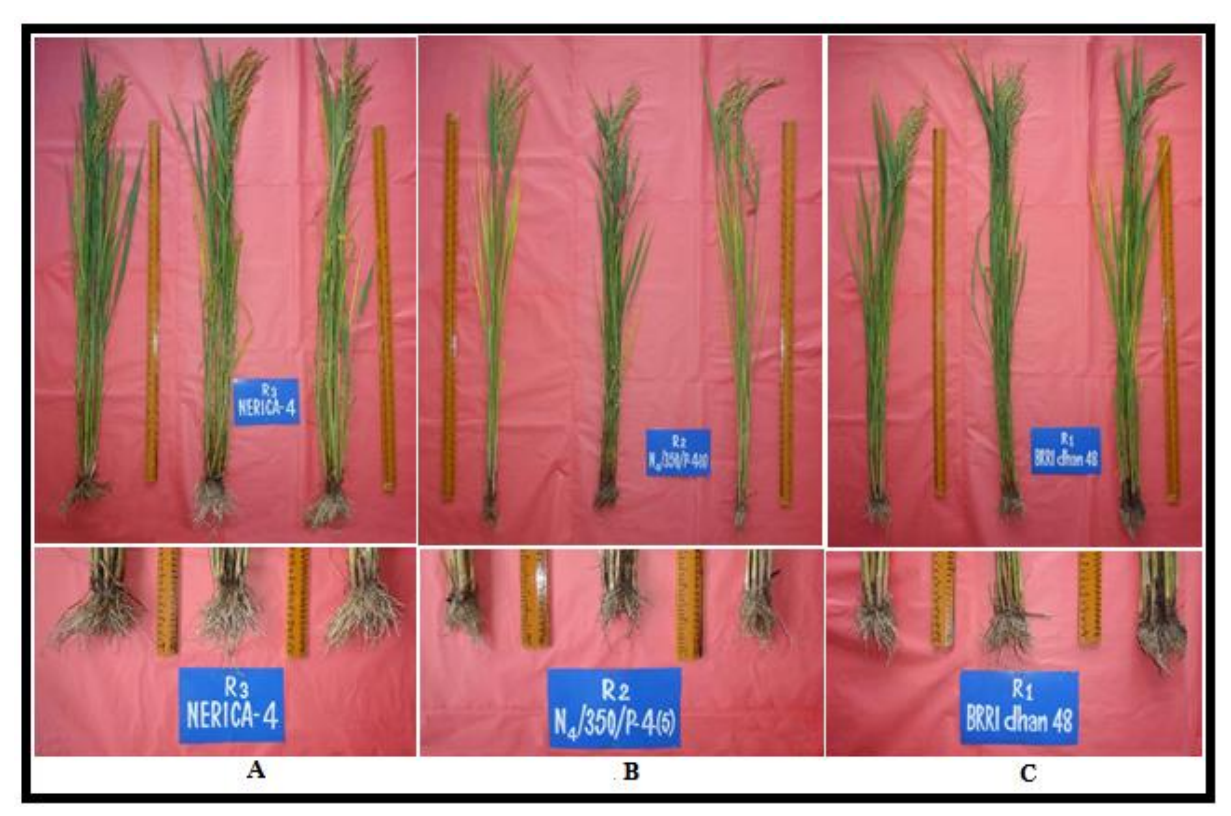
Fig. 2. Plant height and root length of NERICA-4 (A), N<sub>4</sub>/350/P-4(5) (B) and BRRI dhan48 (C).

high pollen viability than its parent and thus produced less unfilled grains. Increased number of unfilled grains/panicle usually gives fewer yields. Unfilled grain is higher at drought or stress condition. There was significant difference in thousand seed weight (Table1). NERICA-4 had the highest weight (33.69g) followed by NERICA mutant N_4/350/P-4(5) (29.26g) and BRRI dhan48 (26.91g). Seed coat of NERICA-4 is hard, bold; seed length and diameter is greater than the others thus weighing more.