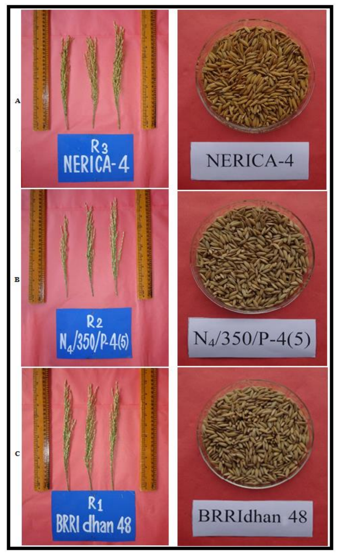
Fig. 3. Panicle length and seed morphology of NERICA-4 (A), N_4/350/P-4(5) (B) and BRRI dhan48 (C).