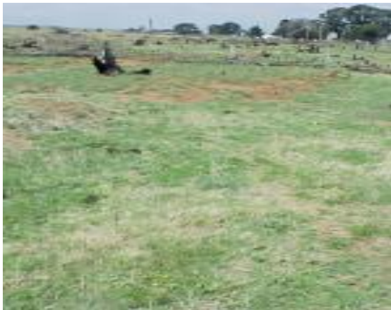
Fig. 10a. Rehabilitation of degraded rangeland in its initial stage: stone lines are established after the area has been cleared of invasive tree species and b. Over sowing with grass seeds, manuring with cattle dung and applications of lime speeds up regeneration of the grass cover.