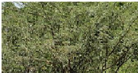
Fig. 14. Prosopis juliflora invasive weed along Garissa Bura Road, Kenya.

Global concern about deforestation caused by fuelwood shortages prompted the introduction of Prosopis juliflora to many tropical areas in the 1970s and 1980s. P. juliflora is a hardy nitrogen-fixing tree that is now recognised as one of the world's most invasive alien species. The introduction and subsequent invasion of P. juliflora in Garissa-Tana River (Plate 14) and Baringo areas of Kenya has attracted national media attention and contradictory responses from responsible agencies. A publication by Mwangi and Swallow (2008) assessed the livelihood effects, costs of control and local perceptions on P. juliflora of rural residents in Baringo area. They noted that unlike some other parts of the world where it had been introduced, few of the potential benefits of P. juliflora had been captured and very few people realised the net benefits in places where the invasion was most advanced. Strong local support for eradication and replacement appears to be well justified. Mwangi and Swallow (2008) advanced that sustainable utilisation of Prosopis would require considerable investment and institutional innovation. In some areas, Prosopis juliflora used as strips have turned into weeds (Sanchez and Jama, 2000), affecting crop performance, while in others, species such as Eichornia crassipes (Water Hyacinth) choke water bodies such as Nairobi dam and L. Victoria waters.