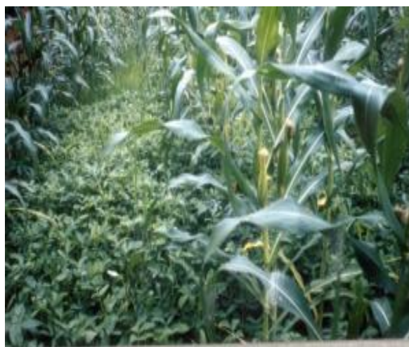
Fig. 9. Conservation tillage. Good ground cover of soil a. and b.