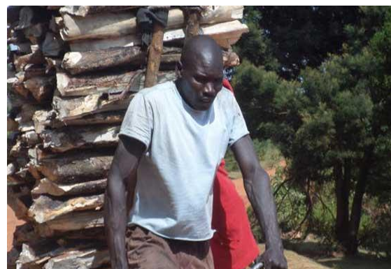
Fig. 1. A man with fired wood collected in Kaptagat forest, Mau complex.

Kipsang (2015) in an article in the standard newspaper bemoaned the human activity threatening important water towers in Kenya especially Kaptagat ( Plate 1 ) that forms part of the Mau complex ( Plate 4 ).