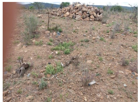
Fig. 12a. Red soil brought from Kiambu for tree b. Natural stones piled for pasture improvement planting in Kisamis, Kenya.

The challenge in management measures is that they are not clear-cut, they require great flexibility and responsiveness at initial stages and in subsequent years that follow.