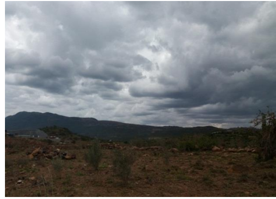
Fig. 11a. Natural stones piled to the left for b. In the background a stone fence plus a high pasture improvement and building a home in mound of gravel from the quarrying in Kisamis, Kisamis, Kenya