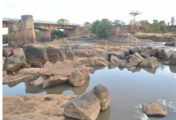
Fig. 3. A section of River Nzoia where water levels have reduced due to prolonged dry season.

in acute sedimentation and indiscriminate cutting of trees were considered among the common factors responsible. It was though, decided that the lake would be restored but the fight between the Barwessa division's residents and the Baringo county council have so far disrupted the initiative.