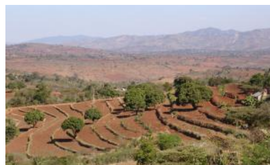
Fig. 8a. Fanya juu bund in maize field after harvest. Note Napier grass strip on upper part of bund, and maize trash in ditch below. 8b. Fanya juu terraces in a semi-arid area which have developed over time into benches. Note the well-established grass strips along the bunds @Hanspeter Liniger, WOCAT.