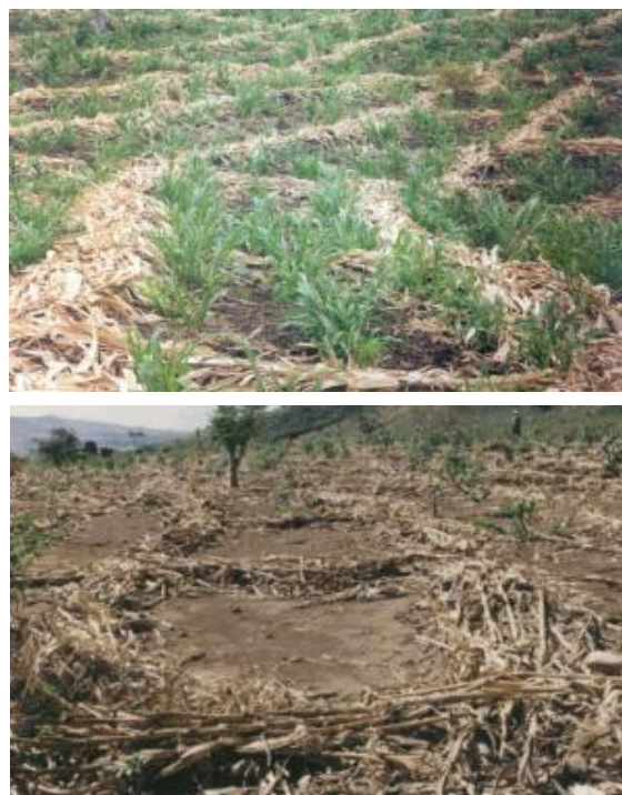
Fig. 13. Trash lines.

Trash lines are extensively used in the Tharaka area of Meru (DAREP, 1994) in Northern Kenya. Trash lines though with no much support from government are used as a traditional soil conservation measure since colonial times in Kenya. Their effectiveness depends on the size of the bunds and their spacing. Large trash lines have been shown to reduce erosion, increase both infiltration and available water to crops leading to increased crop yields (Okoba et al. , 1998; Wakindiki and Ben-Hur, 2002).