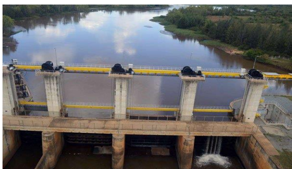
Fig. 2a. Lake Kamnyarok above as it dries and water dwindles 2b, Sondu-Miriu hydroelectric power plant below in Nyakach, Kisumu County, on February 14, 2018 and currently operating at half capacity due to the declining water levels.