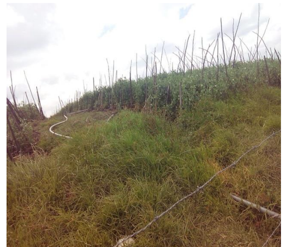
Fig. 7. Water abstraction from the lake Ol’Bolossat for agriculture: 11th February 2016.

In the management (Okech, 2010). These challenges are in turn manifested in poor conservation measures of L. Ol’Bolossat due to the tragedy of the commons. The free rider rationale where no individual community member bears responsibility. Poor land-use systems together with resource user conflicts, political marginalization, poverty, weak institutions