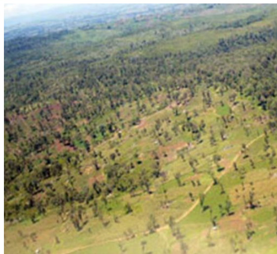
Fig. 4. Mau Forest Complex, one of Kenya's most important water catchments, is severely threatened by unsustainable exploitation such as forest clearing for charcoal production

L. Ol'Bolossat watershed has been affected by anthropogenic disturbances (Karuku & Mugo 2016). In the headwater catchments of the central Kenya, a prevalent cause of land degradation is unplanned deforestation to allow for human settlements and subsistence agriculture. In the highlands of Nyandarua, the ubiquitous land-use changes are believed to be the major cause of the dwindling volumes of L. Ol'Bolossat ( Plates 5, 6 & 7 ), which has recently been declared an endangered water body by the regional government of Kenya (NEMA, 2007). So far, few studies have been carried out on the spatial-temporal lands cover changes possibly affecting the size of L. Ol'Bolossat hence lack of reliable in-situ data. Accumulation of organic matter and silt from the surrounding farmlands have contributed to water pollution and fluctuation of water level from zero to 250cm depending on rainfall, surface run off and seepage from the basin (Wamiti et al. , 2007). The lake suffers domestic and agricultural pollution due to unsustainable farming practices that lead to occurrence of waterborne diseases (Ruhiiu, 2000). According to the forest Act 2005, Kenya Forestry Services (KFS) has the mandate of managing Kenyan Forests. The law allows for collaboration and participation of the local community living adjacent to the forest to conserve the forest in question and in return earn a living through extraction of non-wood products.