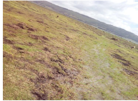
Fig. 6. Effects of erosion into the lake Ol’Bolossat: 11th February 2016.