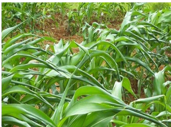
Fig. 2. Curled maize leaves as an indicator of moisture stress.

Grain yield for treatment T25 was 55 and 56% lower compared to that attained in T50 and T75 treatments, respectively (table 3). When moisture fell to 25% of AWC, plants showed signs of moisture stress such as curling of leaves (fig. 2) probably because it became harder for plant roots to extract water because it was held at higher pressure in the soil matrix.