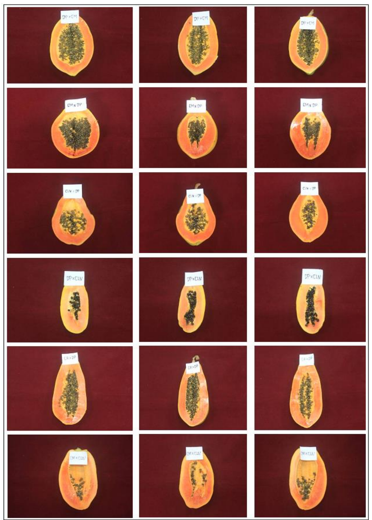
Fig. 2. Color on the inside of papaya.

properties and fruit quality that is suitable for the taste and acceptable to consumers.