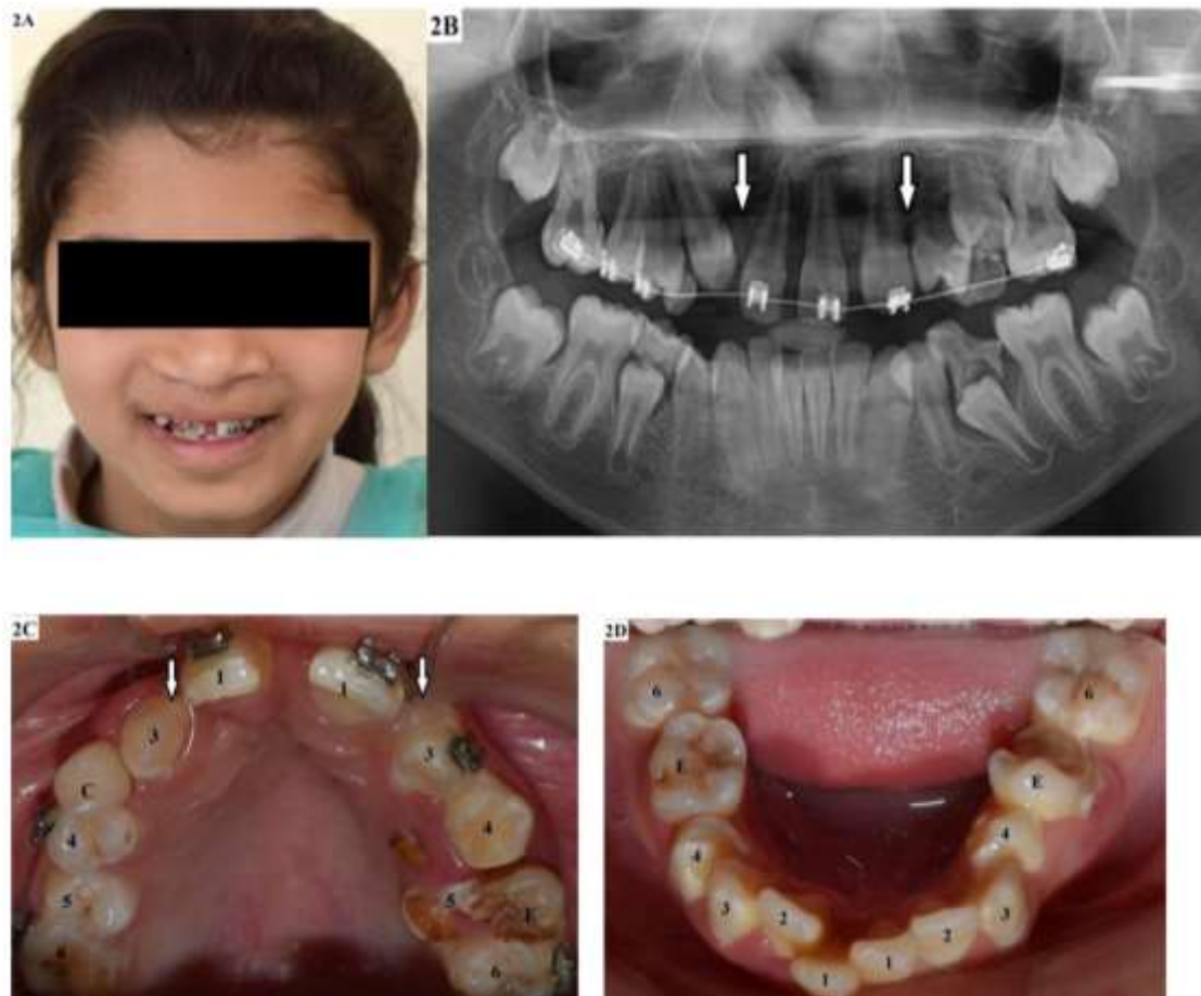
Fig. 2. (A) Affected individual of family 2 (B) OPG X-rays of affected individual showing two permanent teeth missing in the lower arches, i.e. both lower second premolars (tooth number 35 & 45), (C) picture of upper arch (D) Picture of lower arch.

Sequence homology search for PAX9 indicates that the substituted alanine residue is conserved across different species (Fig. 3B), which suggests that this amino acid is important for the PAX9 function.