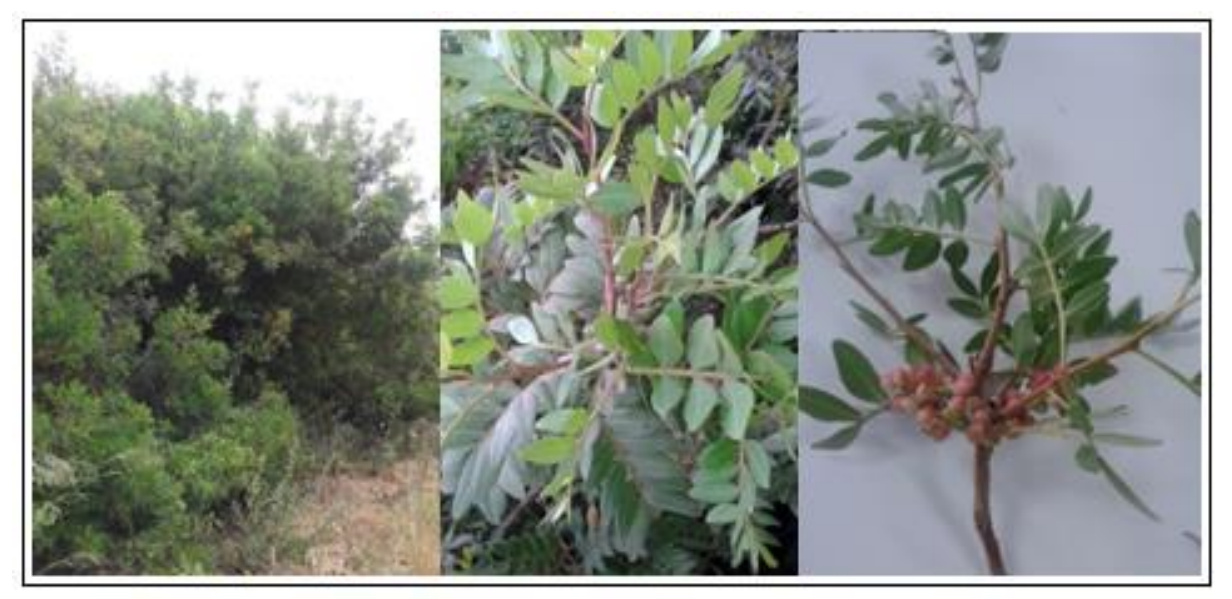
Fig. 1. Pistacia lentiscusof Mostaganem province, Algeria.

As seen in table (3), the essential oil of Pistacia lentiscus revealed a strong inhibitory activity against all germs tested. Although, the microorganisms studied did not express the same sensitivity. The data indicated that Helicobacter pylori is inhibited at a concentration of 1/1000 (v/v), while Escherichia coli ,